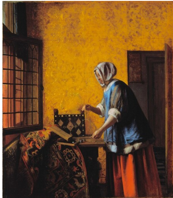
fig. 4 Pieter de Hooch, A Woman Weighing Gold , mid-1660s, oil on canvas, Staatliche Museen zu Berlin, Preussischer Kulturbesitz, Gemäldegalerie.