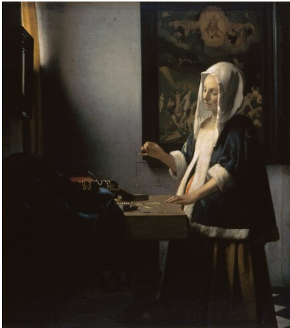
fig. 3 Before the 1994 conservation treatment, Johannes Vermeer, Woman Holding a Balance , c. 1664, oil on canvas, National Gallery of Art, Washington, Widener Collection, 1942.9.97