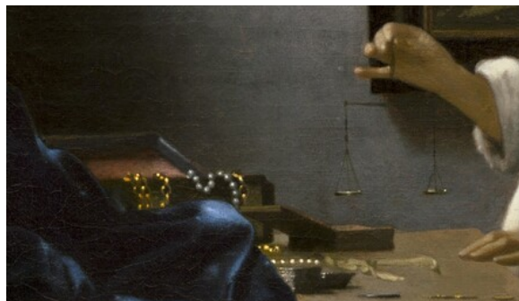
fig. 1 Detail, Johannes Vermeer, Woman Holding a Balance , c. 1664, oil on canvas, National Gallery of Art, Washington, Widener Collection, 1942.9.97