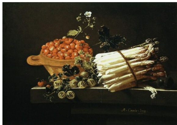
fig. 2 Adriaen Coorte, Still Life with a Bowl of Strawberries and Gooseberries , 1696, oil on canvas, private collection