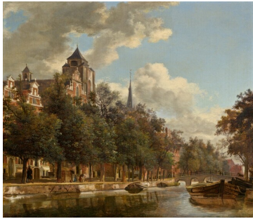
Jan van der Heyden Dutch, 1637 - 1712