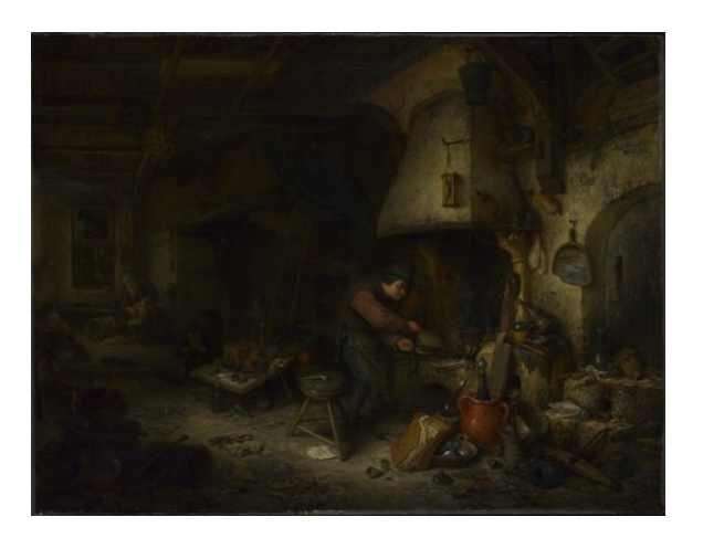
fig. 2 Adriaen van Ostade, The Alchemist , 1661, oil on oak, National Gallery, London.