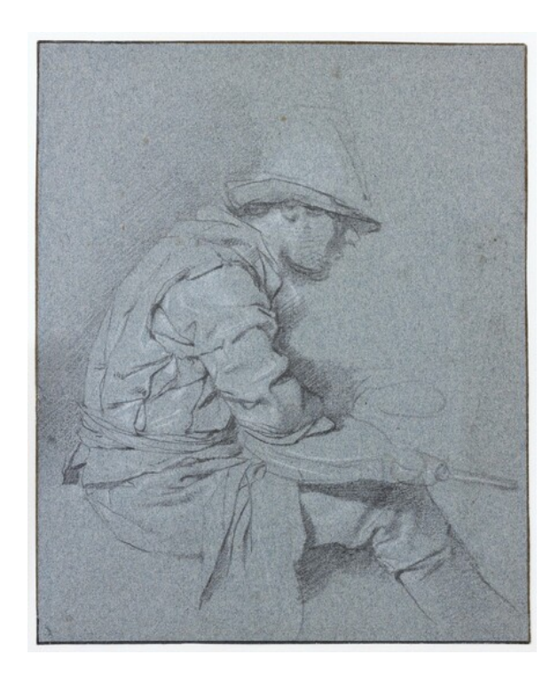
fig. 6 Cornelis Bega, Study of an Alchemist , c. 1663, black chalk with white heightening on blue paper, Museum Mayer van den Bergh, Antwerp, inv. no. MMB.1049.