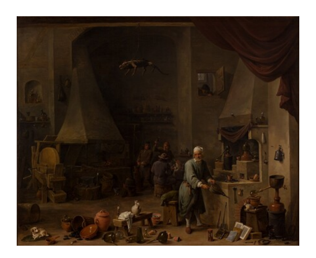
fig. 5 David Teniers the Younger, Interior of a Laboratory with an Alchemist , c. 1650, oil on canvas, Chemical Heritage Foundation Collections, inv. FA. 00-03-23.