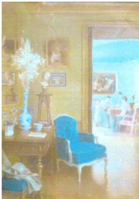
fig. 6 Etienne Azambre, Interior of a French Country Estate , c. 1900, watercolor, private collection