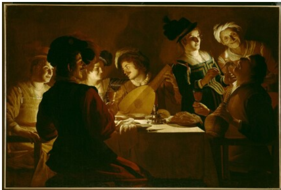
fig. 1 Gerrit van Honthorst, Merry Company with a Lute Player , c. 1620, oil on canvas, Uffizi Gallery, Florence.