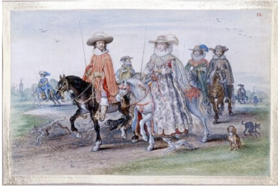
fig. 7 Adriaen van de Venne, "The King and Queen of Bohemia," from Adriaen van de Venne's Common-Place Book , c. 1626, watercolor, The British Museum, London.