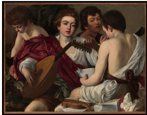
fig. 2 Michelangelo Merisi da Caravaggio, The Musicians , c. 1595, oil on canvas, Metropolitan Museum of Art, New York, Rogers Fund, 1952 (52.81)