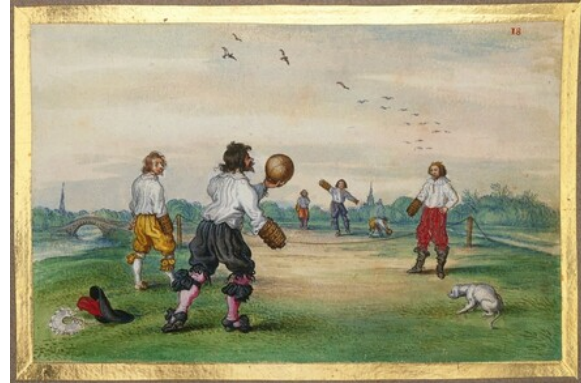
fig. 8 Detail, Adriaen van de Venne, "A Game of Balloon," from Adriaen van de Venne's Common-Place Book , c. 1626, watercolor, The British Museum, London.