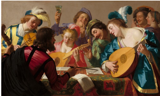
Gerrit van Honthorst Dutch, 1592 - 1656