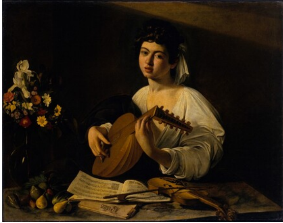
fig. 3 Michelangelo Merisi da Caravaggio, The Lute Player , c. 1595–1596, oil on canvas, The State Hermitage Museum, Saint Petersburg.