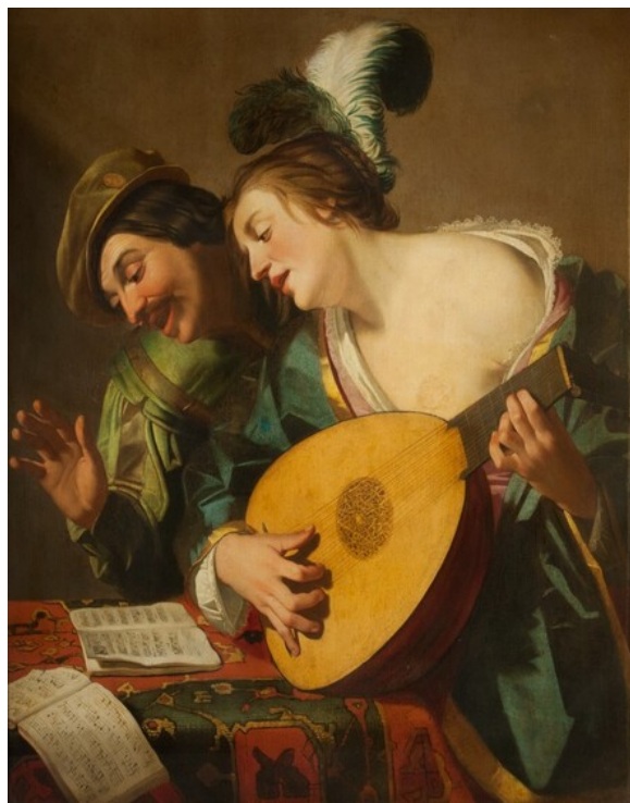
fig. 5 (style of) Hendrick ter Brugghen, The Music Lesson , oil on canvas, The Whitaker (previously Rossendale Museum & Art Gallery), inv. PA-129