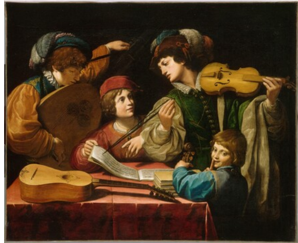
fig. 4 Leonello Spada, The Concert , c. 1615, oil on canvas, Musée du Louvre, Paris, inv. 681.