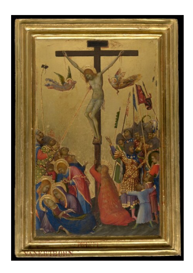
fig. 1 Simone Martini, Crucifixion (from the Orsini Polyptych), c. 1335, tempera on panel, Royal Museum of Fine Arts, Antwerp