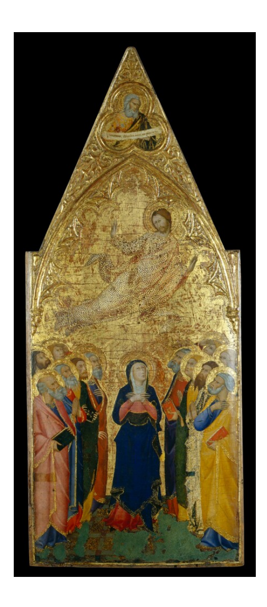
fig. 3 Andrea di Vanni, Ascension, c. 1380s, tempera on panel, The State Hermitage Museum, St. Petersburg, Gift of the heirs of Count G. S. Stroganov, 1911

Italian Paintings of the Thirteenth and Fourteenth Centuries