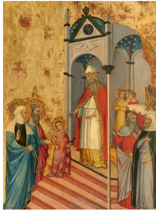
Andrea di Bartolo Sienese, active from 1389 - died 1428