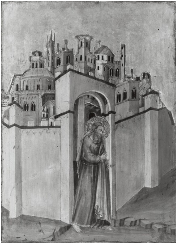
fig. 1 Andrea di Bartolo, Joachim Leaving Jerusalem , c. 1400/1405, tempera on panel, Keresztény Múzeum, Esztergom, Hungary