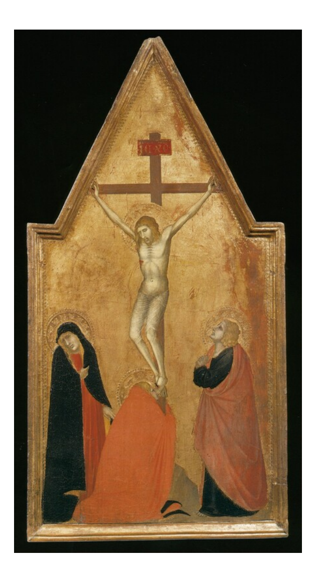
fig. 2 Pietro Lorenzetti, Crucifixion, c. 1325–1326, tempera on panel, Pinacoteca Nazionale, Siena