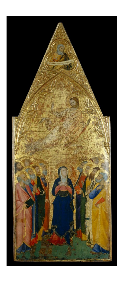
fig. 3 Andrea di Vanni, Ascension, c. 1380s, tempera on panel, The State Hermitage Museum, St. Petersburg, Gift of the heirs of Count G. S. Stroganov, 1911

Italian Paintings of the Thirteenth and Fourteenth Centuries