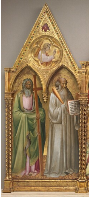
Agnolo Gaddi Florentine, c. 1350 - 1396