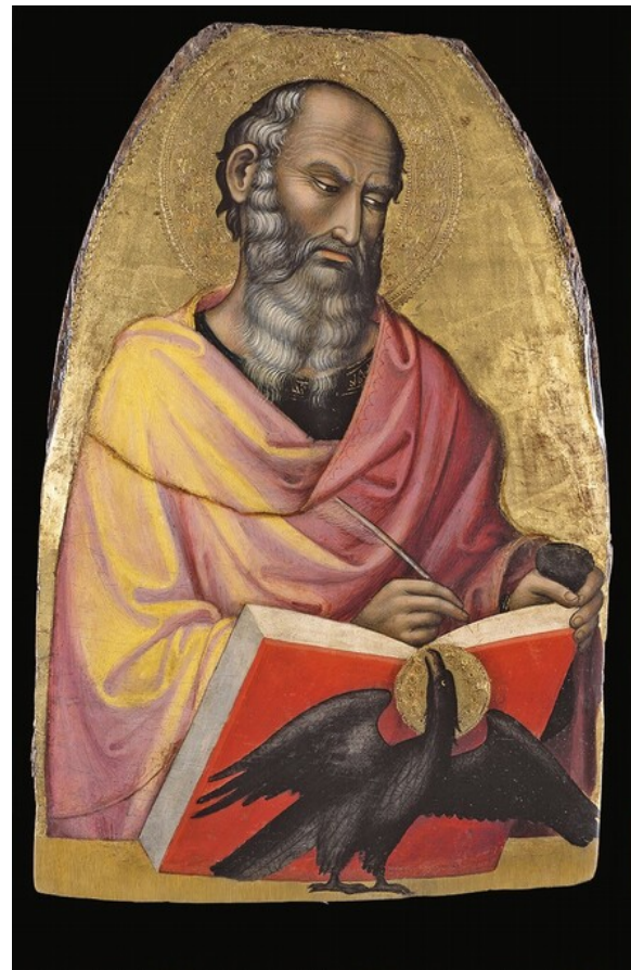
fig. 2 Martino di Bartolomeo, Saint John the Evangelist, 1425–1426, tempera on panel, private collection.