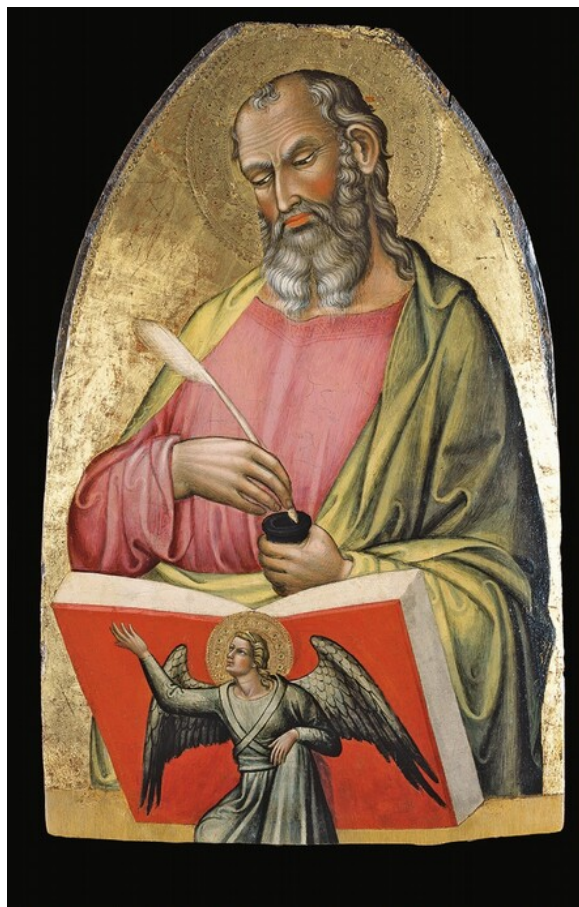
fig. 3 Martino di Bartolomeo, Saint Matthew, 1425–1426, tempera on panel, private collection.