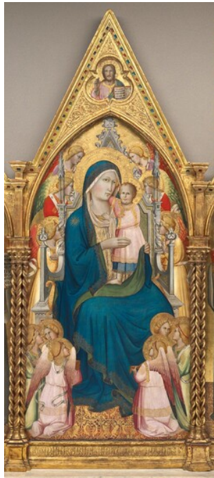
Agnolo Gaddi Florentine, c. 1350 - 1396