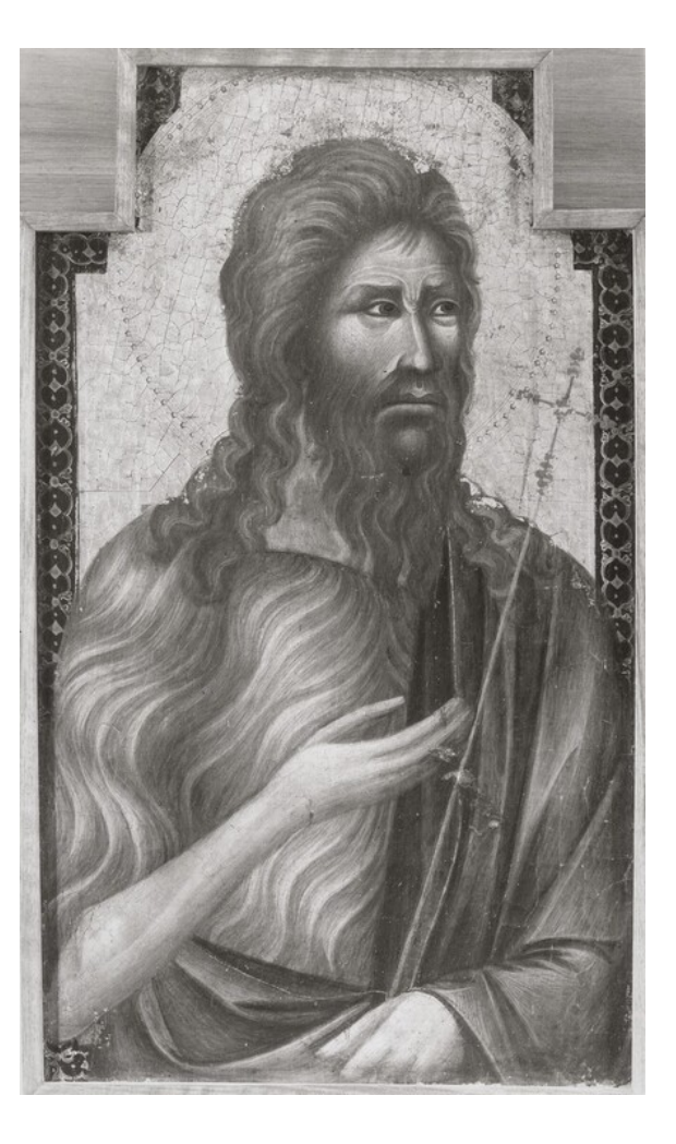
fig. 2 Grifo di Tancredi, Saint John the Baptist , c. 1310, tempera on panel, Musée des Beaux-Arts, Chambéry

fig. 1 Reconstruction of a dispersed polyptych by Grifo di Tancredi (color images are NGA objects): a. Saint Peter ; b. Saint John the Baptist (fig. 2); c. Christ Blessing ; d. Saint James Major ; e. After Grifo di Tancredi, line drawing of a lost image of Saint Ursula