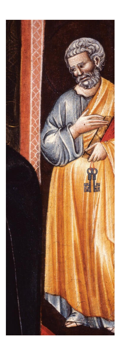
fig. 4 Detail, Grifo di Tancredi, Christ Blessing , c. 1310, tempera on poplar, National Gallery of Art, Washington, Andrew W. Mellon Collection

fig. 3 Detail of Saint Peter, Grifo di Tancredi, San Gaggio altarpiece, c. 1300, tempera on panel, Galleria dell'Academia, Florence