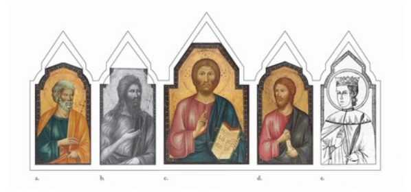
fig. 1 Reconstruction of a dispersed polyptych by Grifo di Tancredi (color images are NGA objects): a. Saint Peter ; b. Saint John the Baptist (fig. 2); c. Christ Blessing ; d. Saint James Major ; e. After Grifo di Tancredi, line drawing of a lost image of Saint Ursula