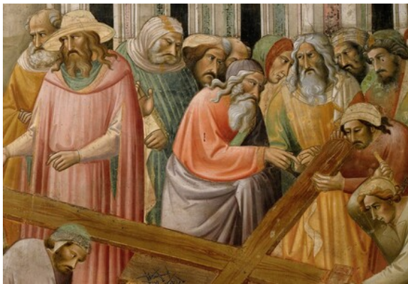
fig. 3 Detail of spectators, Agnolo Gaddi, The Making of the Cross , 1385–1390, fresco, Cappella Maggiore, Santa Croce, Florence. Image: Scala/Art Resource, NY