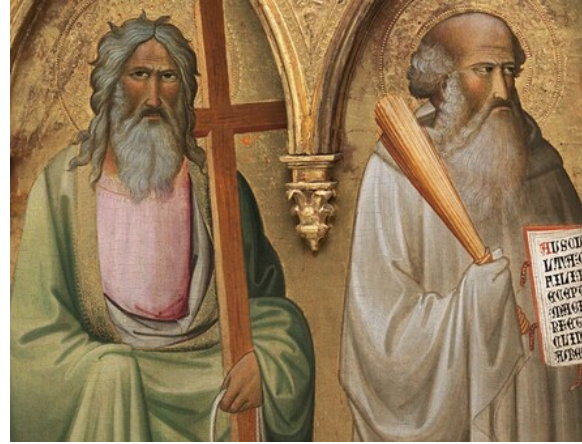
fig. 2 Detail of Saint Andrew (left), Agnolo Gaddi, Madonna and Child with Saints Andrew, Benedict, Bernard, and Catherine of Alexandria with Angels , shortly before 1387, tempera on poplar, National Gallery of Art, Washington, Samuel H. Kress Collection