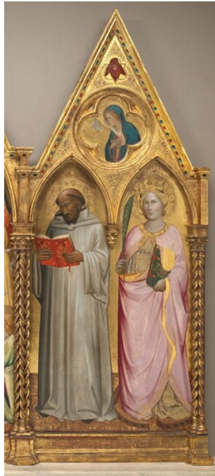
Agnolo Gaddi Florentine, c. 1350 - 1396