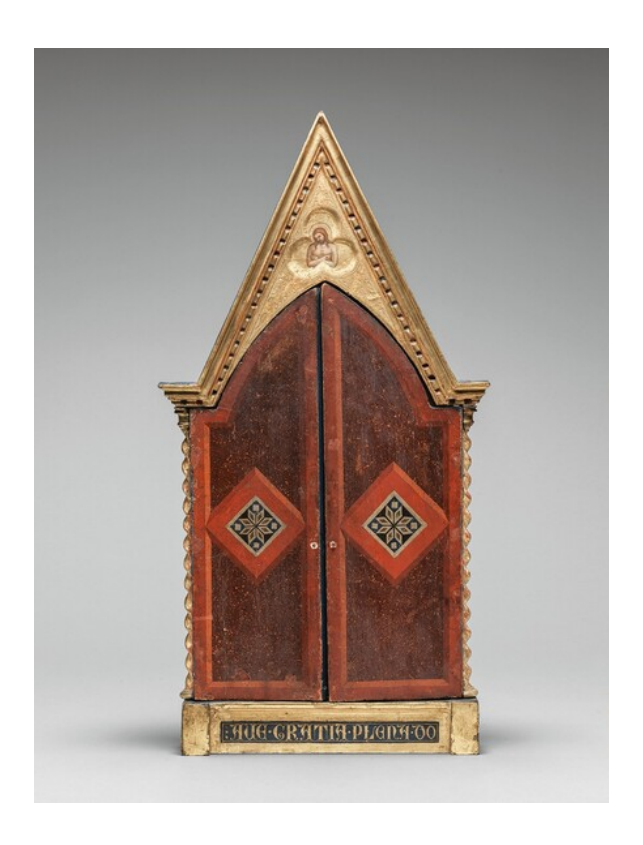
fig. 1 Exterior view of portable triptych with wings closed, tempera on panel, National Gallery of Art, Washington, Samuel H. Kress Collection

Italian Paintings of the Thirteenth and Fourteenth Centuries