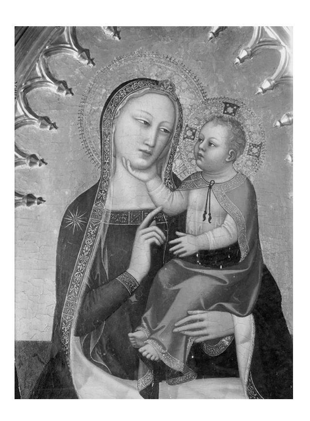
fig. 4 Nardo di Cione, Madonna and Child, tempera on panel, Bojnice Castle, Slovakia