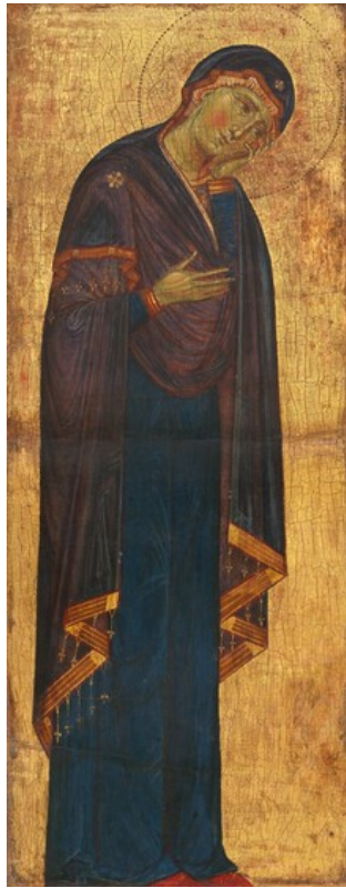
Master of the Franciscan Crucifixes Umbrian, active 1260s and 1270s