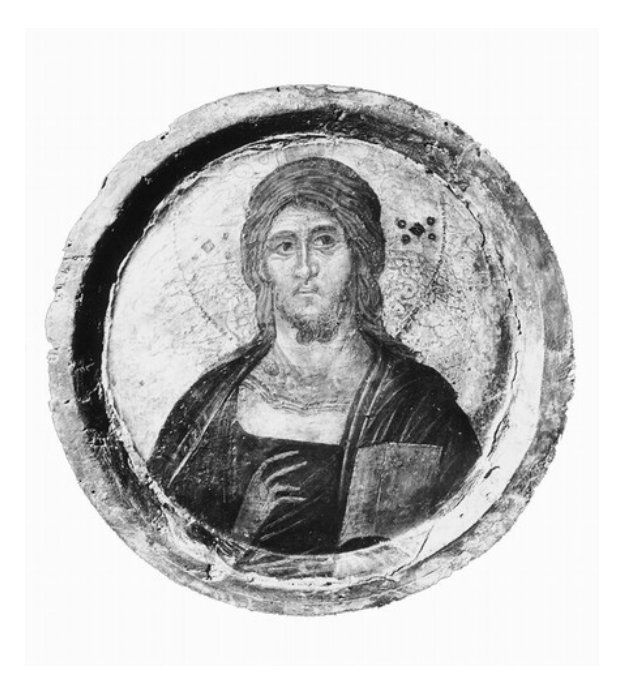
fig. 2 Master of the Franciscan Crucifixes, Bust of the Blessing Christ , c. 1270/1275, tempera on panel, now lost

fig. 1 Reconstruction of a painted crucifix, formerly in San Francesco, Bologna, by the Master of the Franciscan Crucifixes (color images are NGA objects): a. Painted Crucifix with the Madonna between Two Angels (above) and the Kneeling Saint Francis (below), and Saint Helen (added by Jacopo di Paolo) (fig. 3); b. The Mourning Madonna ; c. The Mourning Saint John the Evangelist ; d. Bust of the Blessing Christ (fig. 2)