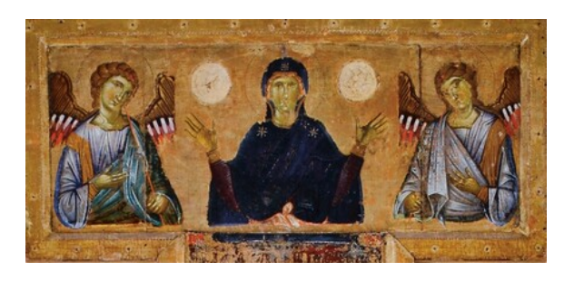
fig. 4 Detail of upper terminal, Master of the Franciscan Crucifixes, Painted Crucifix with the Madonna between Two Angels , c. 1270/1275, tempera on panel, Pinacoteca Nazionale di Bologna

fig. 3 Master of the Franciscan Crucifixes, Painted Crucifix with the Madonna between Two Angels (above) and the Kneeling Saint Francis (below), and Saint Helen (added by Jacopo di Paolo), c. 1270/1275, tempera on panel, Pinacoteca Nazionale di Bologna