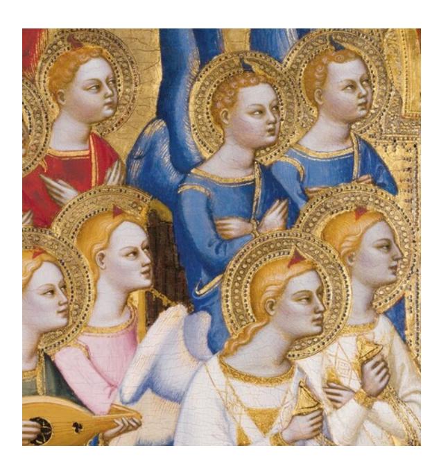
fig. 3 Detail of angels in adoration, Jacopo di Cione, San Pier Maggiore altarpiece, 1370–1371, tempera on panel, National Gallery, London.