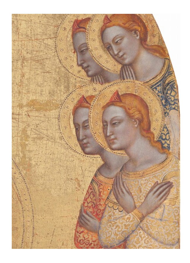
fig. 2 Detail of angels, Jacopo di Cione, Madonna and Child with God the Father Blessing and Angels, c. 1370/1375, tempera on panel, National Gallery of Art, Washington, Samuel H. Kress Collection