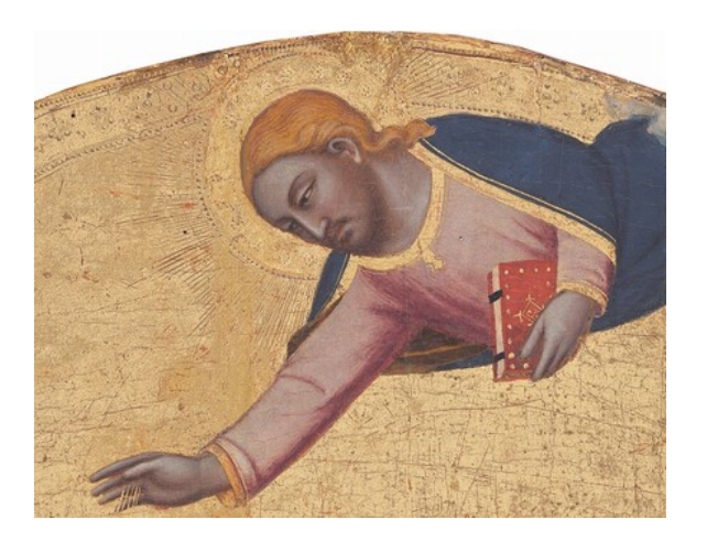
fig. 4 Detail of God the Father, Jacopo di Cione, Madonna and Child with God the Father Blessing and Angels, c. 1370/1375, tempera on panel, National Gallery of Art, Washington, Samuel H. Kress Collection