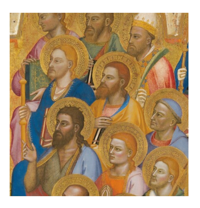
fig. 6 Detail of adoring saints, Jacopo di Cione, San Pier Maggiore altarpiece, 1370–1371, tempera on panel, National Gallery, London.