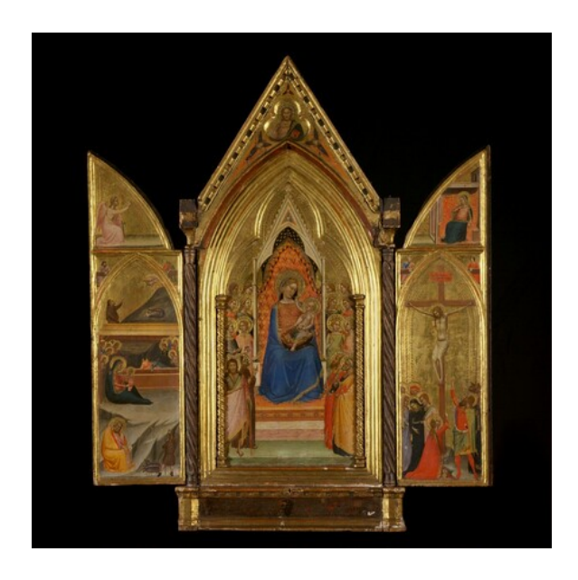
fig. 1 Bernardo Daddi, Virgin and Child Enthroned with Saints, and God in an Attitude of Benediction , 1338, tempera and gold leaf on panel, Courtauld Institute of Art, The Courtauld Gallery, London.

Italian Paintings of the Thirteenth and Fourteenth Centuries