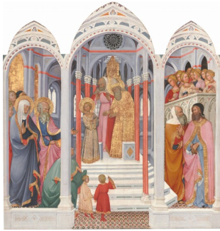
Paolo di Giovanni Fei Sienese, c. 1335/1345 - 1411