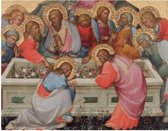
fig. 3 Detail of figures reacting to the miracle of the flowers in place of Mary's body, Paolo di Giovanni Fei, The Assumption of the Virgin with Busts of the Archangel Gabriel and the Virgin of the Annunciation , c. 1400/1405, tempera on panel, National Gallery of Art, Washington, Samuel H. Kress Collection