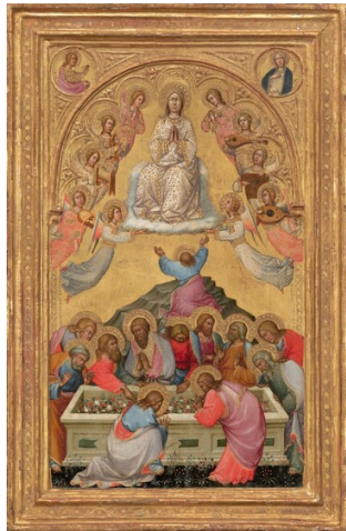
Paolo di Giovanni Fei Sienese, c. 1335/1345 - 1411