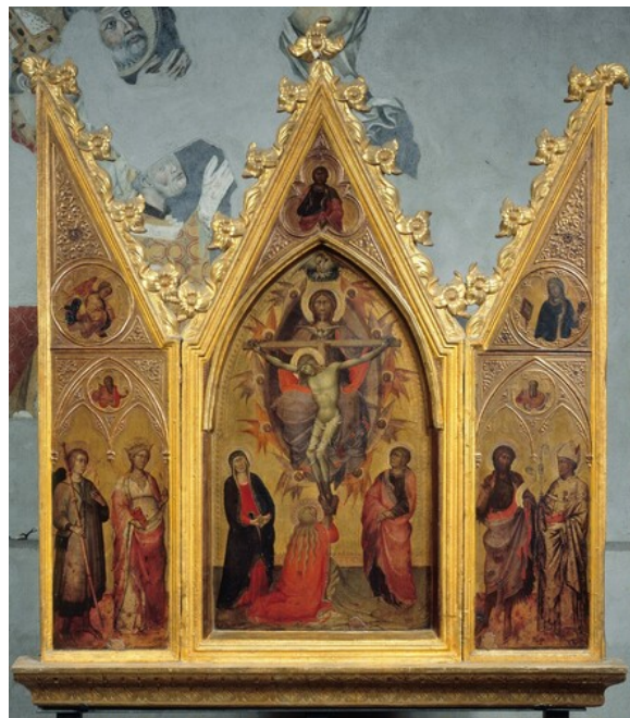
fig. 2 Paolo di Giovanni Fei, Triptych from the Minutolo Chapel, 1407–1408, tempera on panel, Naples Cathedral.