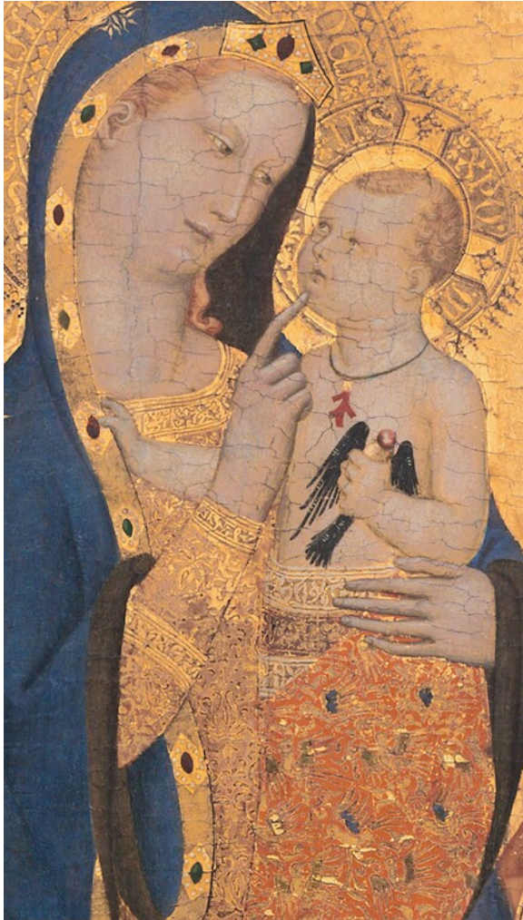
fig. 1 Detail of Madonna and Child (central panel), Puccio di Simone and Allegretto Nuzi, Madonna and Child Enthroned with Saints and Angels , 1354, tempera on panel, National Gallery of Art, Washington, Andrew W. Mellon Collection