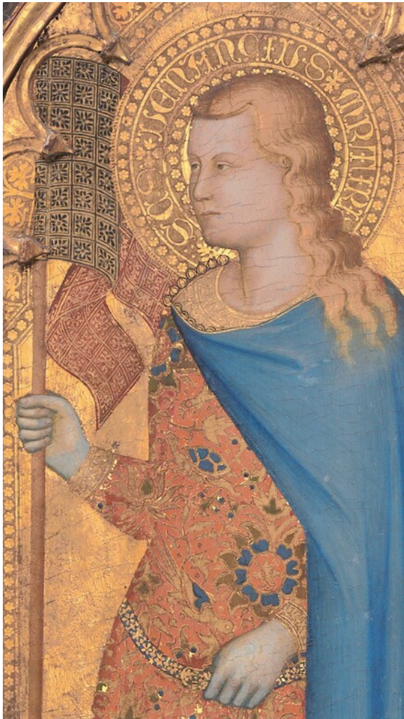
fig. 3 Detail of Saint Venantius (right panel), Puccio di Simone and Allegretto Nuzi, Madonna and Child Enthroned with Saints and Angels , 1354, tempera on panel, National Gallery of Art, Washington, Andrew W. Mellon Collection