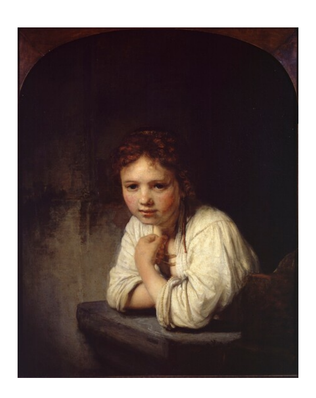
fig. 1 Rembrandt van Rijn, Girl at a Window , 1645, oil on canvas, Dulwich Picture Gallery, London.