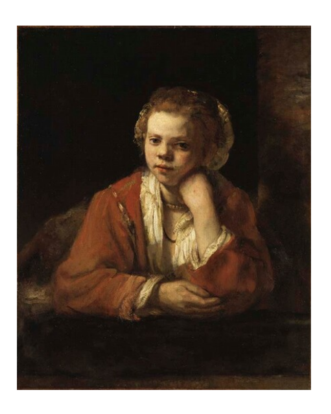
fig. 4 Rembrandt van Rijn, Servant Girl at a Window , 1651, oil on canvas, Nationalmuseum, Stockholm