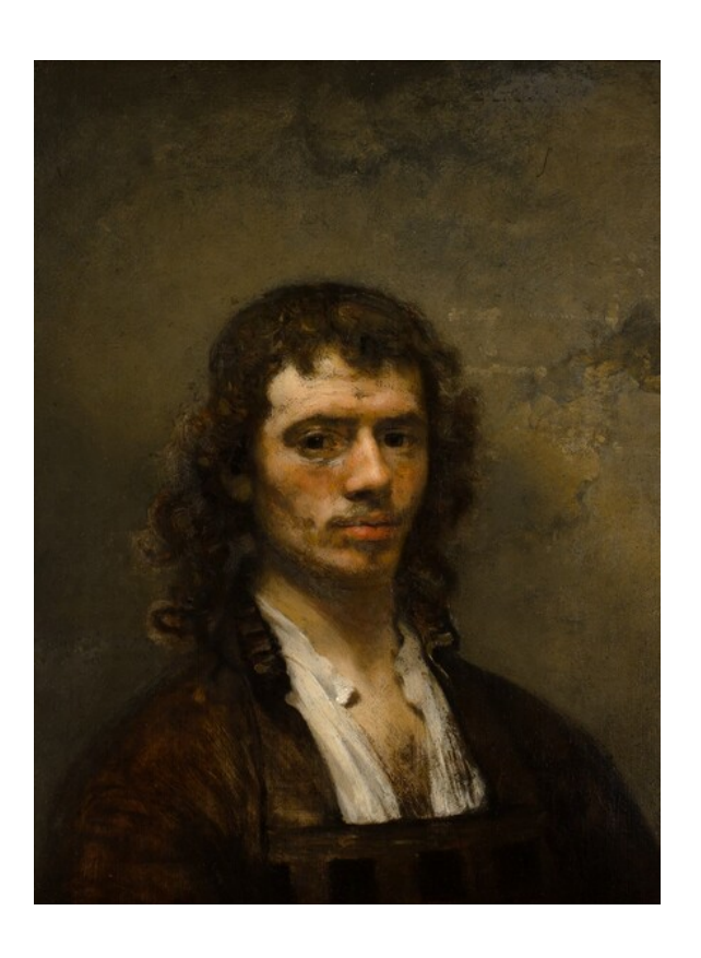
fig. 8 Carel Fabritius, Self-Portrait, c. 1645–1648, oil on canvas, Museum Boijmans Van Beuningen, Rotterdam.