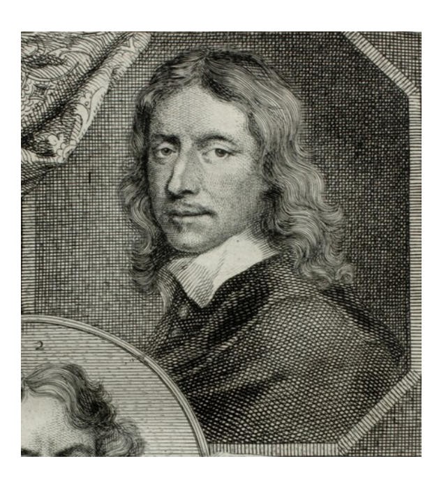
fig. 4 Arnold Houbraken, Govert Flinck , shown in reverse, from De groote schouburgh der Nederlantsche konstschilders en schilderessen , The Hague, 1753