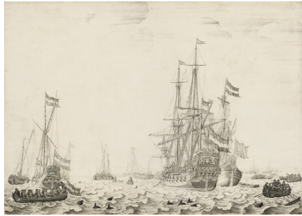
Willem van de Velde the Elder Dutch, 1611 - 1693