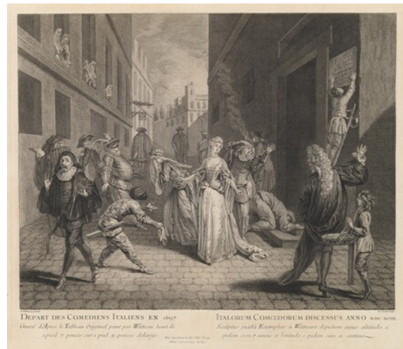
fig. 2 Louis Jacob after Jean Antoine Watteau, The Departure of the Italian Comedians in 1697 , in L'oeuvre d'Antoine Watteau (volume II) , c. 1740, engraving, National Gallery of Art, Washington, Widener Collection, 1942.9.2093