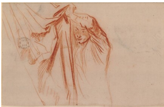
fig. 7 Antoine Watteau, Man Raising a Curtain , c. 1719, red chalk, British Museum, London.