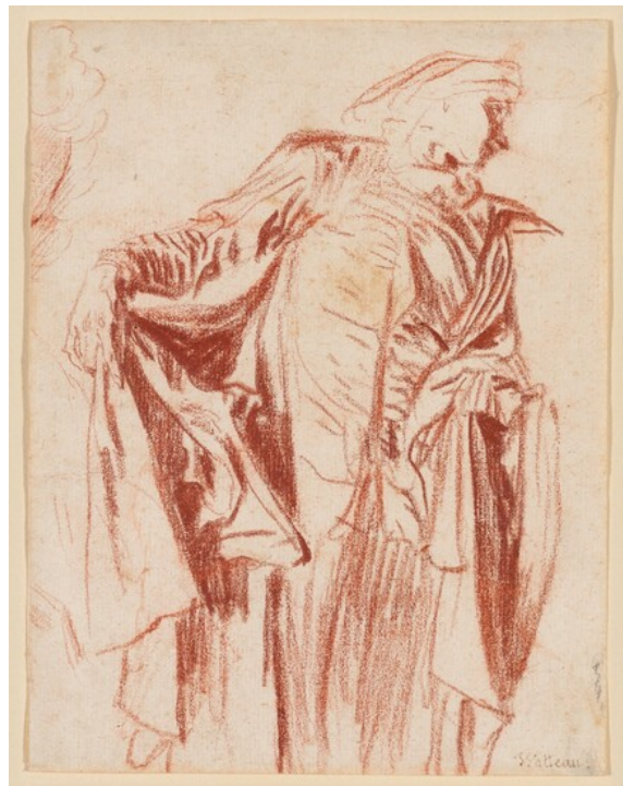
fig. 6 Antoine Watteau, An Actor, c. 1719, red chalk, Minneapolis Institute of Art, The John R. Van Derlip Fund 69.88.