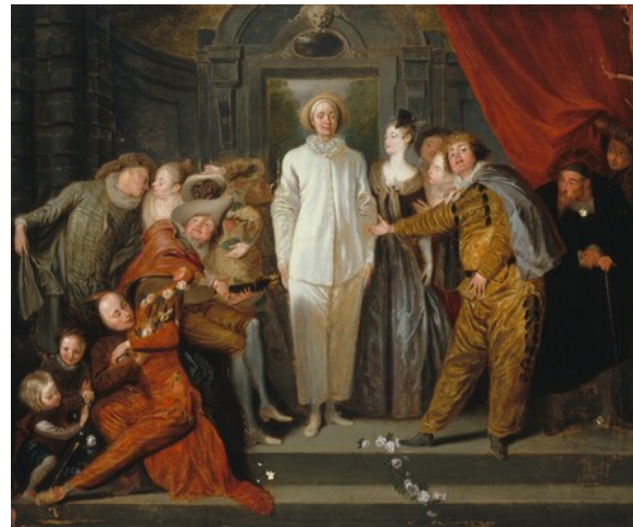
fig. 4 Cleaned state, before restoration, Antoine Watteau, The Italian Comedians , probably 1720, oil on canvas, National Gallery of Art, Washington, Samuel H. Kress Collection, 1946.7.9