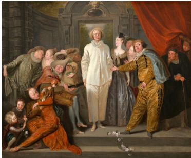
Antoine Watteau French, 1684 - 1721