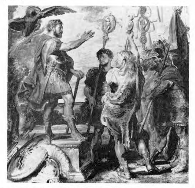
Decius Mus Addressing the Legions: Peter Paul Rubens. Samuel H. Kress Collection, National Gallery of Art.