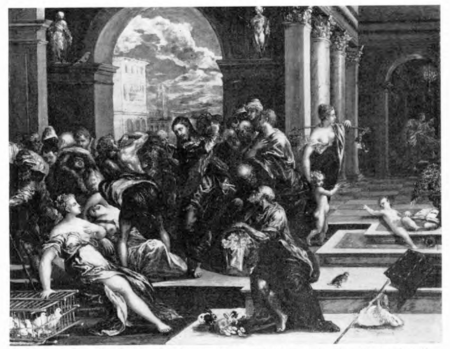
Christ Cleansing the Temple: El Greco. Samuel H. Kress Collection, National Gallery of Art.