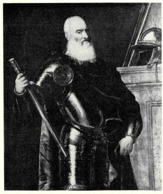
Vincenzo Capello: Titian. Samuel H. Kress Collection, National Gallery of Art.