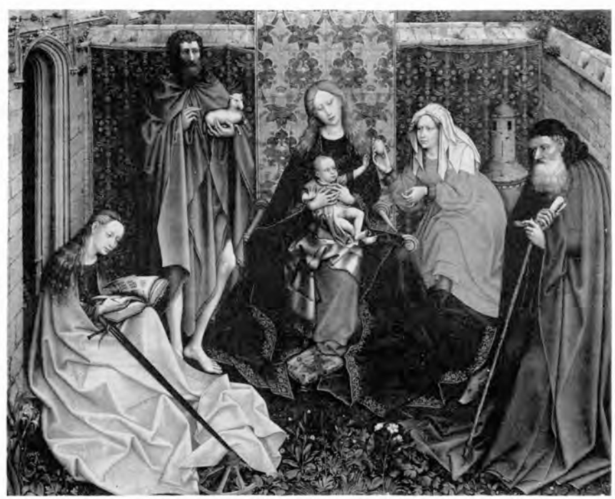
Madonna and Child with Saints in the Enclosed Gardens: Master of Flémalle and Assistants. Samuel H. Kress Collection, National Gallery of Art.