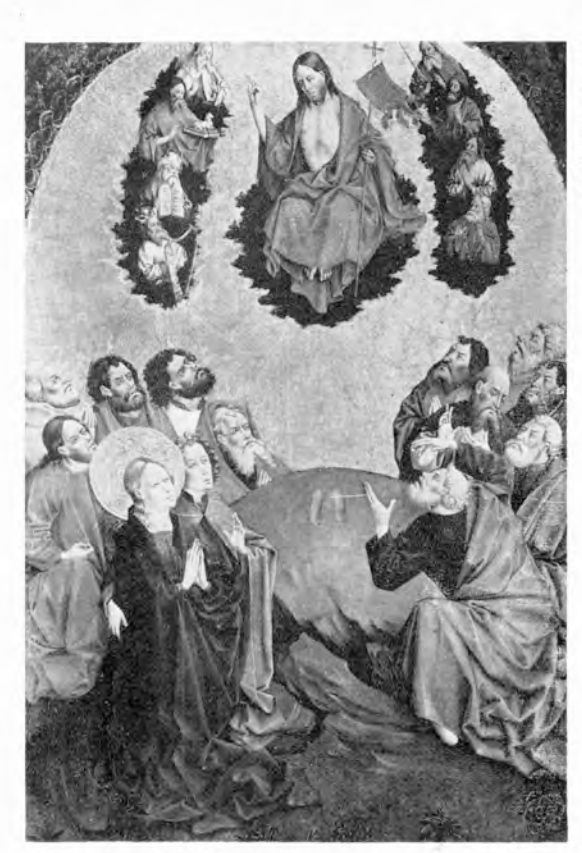
2. The Ascension: Johann Koerbecke. Samuel H. Kress Collection, National Gallery of Art.