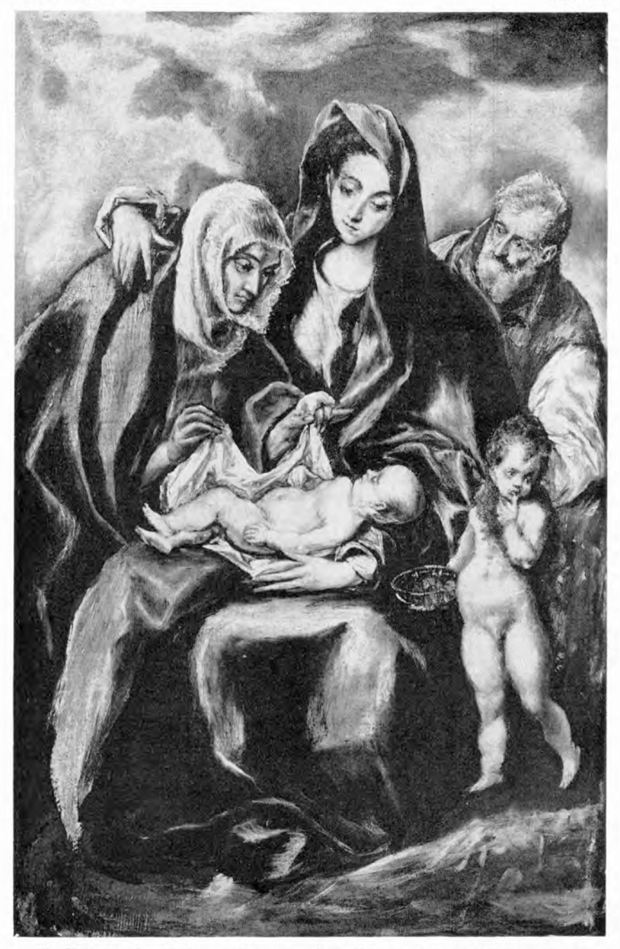
The Holy Family: El Greco. Samuel H. Kress Collection, National Gallery of Art.