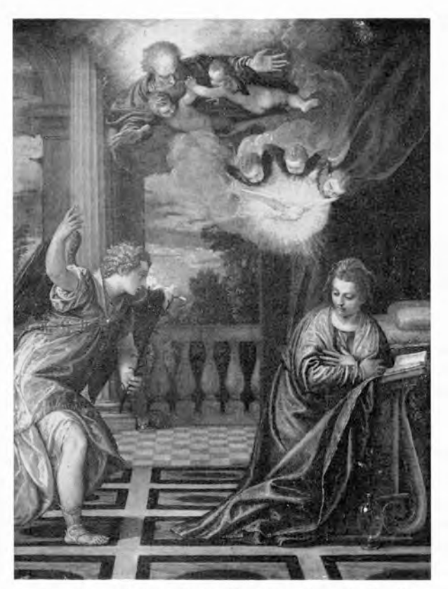
The Annunciation: Paolo Veronese. Samuel H. Kress Collection, National Gallery of Art.