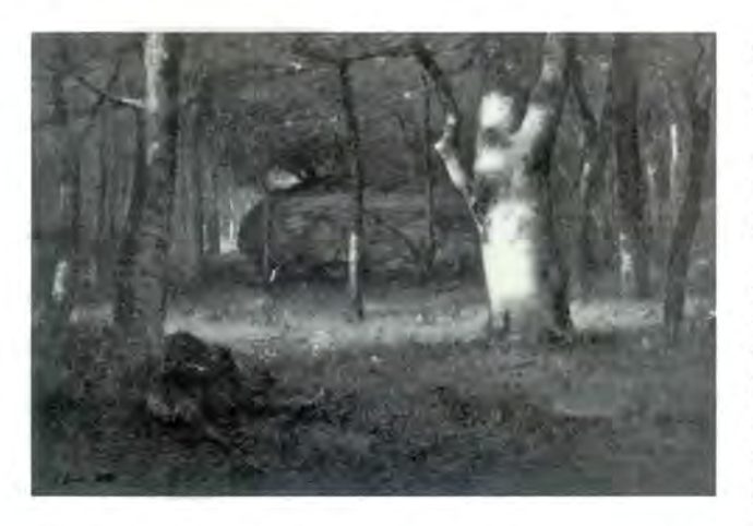
Fig. 12. George Inness, Sunset in the Woods, 1891, oil on canvas, The Corcoran Gallery of Art, Museum Purchase

color that induce the viewer to meditate and contemplate the spiritual realities, what Inness called "the region of truth," that lie beyond the physical reality (see fig. 12).