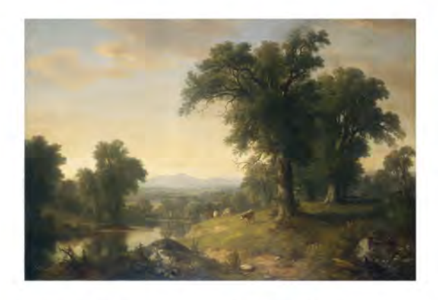
LEFT: Fig. 6. Asher B. Durand, Forest in the Morning Light, c. 1855, oil on canvas, National Gallery of Art, Washington, Gift of Frederick Sturges, Jr. ABOVE: Fig. 7. Asher B. Durand, A Pastoral Scene, 1858, oil on canvas, National Gallery of Art, Washington, Gift of Frederick Sturges, Jr.

of the trees that were felled to build the home dot the foreground in sharp contrast to the seemingly endless wilderness immediately behind the dwelling (see slide 8). This is the confrontation of rudimentary civilization and the untamed wilderness, and it was a theme of such meaning to Americans in a still-uncharted continent that it continued to inspire artists for several generations.