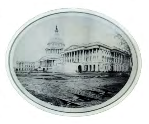
Fig. 9. U.S. Capitol, photographed according to Act of Congress, 1865, G. D. Wakely

The attraction of Europe grew strong once again, for newly wealthy American tourists and for ambitious artists. Many of the former brought paintings, sculpture, and objets d'art home from their travels, works that greatly influenced other collectors and the public generally. Many of these works of art eventually found their way into American museums, which had multiplied in the last third of the century. Artists who traveled abroad continued to study the great collections of old master paintings. After 1880, however, they also found themselves