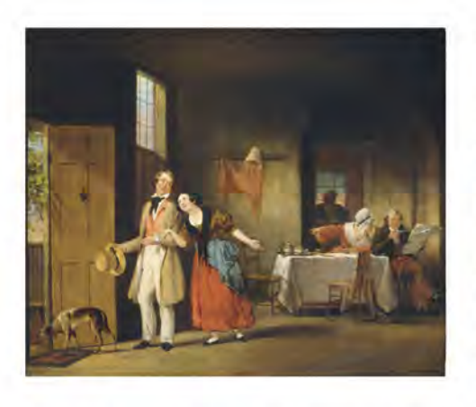
Fig. 4. Francis William Edmonds. The Bashful Cousin, c. 1842, oil on canvas. National Gallery of Art, Washington, Gilt of Frederick Sturges, Jr.

provided subjects for art, however, the federal government was unwilling to provide patronage for civic art. History painter John Trumbull produced a series of revolutionary war scenes, some of which were engraved for distribution to subscribers. All of the images were intended as models for larger paintings for which he sought commissions, especially from the federal government. But no official commission was forthcoming for more than three decades. In 1817 Congress at last asked Trumbull to produce four large paintings for the Capitol Rotunda. Other artists faced equal indifference in their