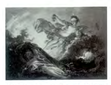
Jean-Honoré Fragonard, Aurora, c. 1743/1755, oil on canvas, private collection

In the companion painting, Aurora appears "rosy fingered" just as Homer described her.