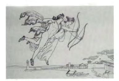
Apollo and Artemis (pl. 24)