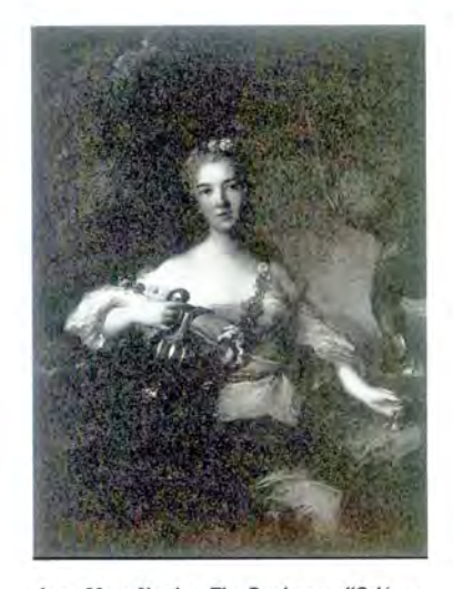
Jean-Marc Nattier, The Duchesse d'Orléans as Hebe, 1744, oil on canvas, The Swedish National Art Museums, Stockholm

Immortal Hebe, fresh with bloom divine The Golden Goblet crowns with purple wine.