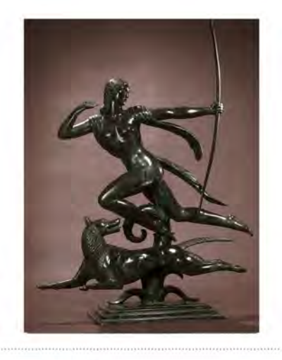
Paul Manship American, 1885–1966