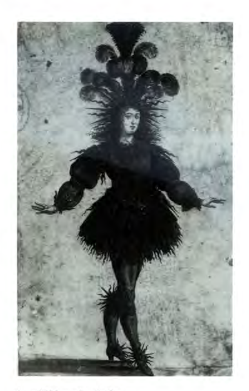
Louis XIV dressed as the Sun God in dramatic performance, 1653, watercolor, Bibliothèque Nationale de France, Paris, (photo: © Bibliothèque Nationale de France, Paris)

Lavish theatrical productions helped to promote Louis' image of absolute monarchy. He appeared in the role of the Sun God during a performance of the ballet Le nuit in 1653.