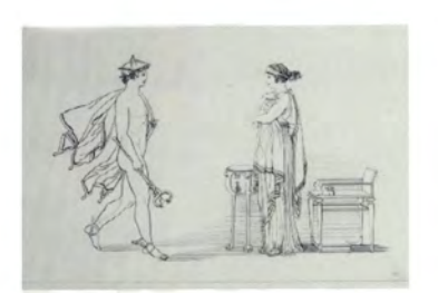
Hermes (pl. 8)