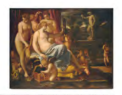
Annibale Carracci Bolognese, 1560 – 1609