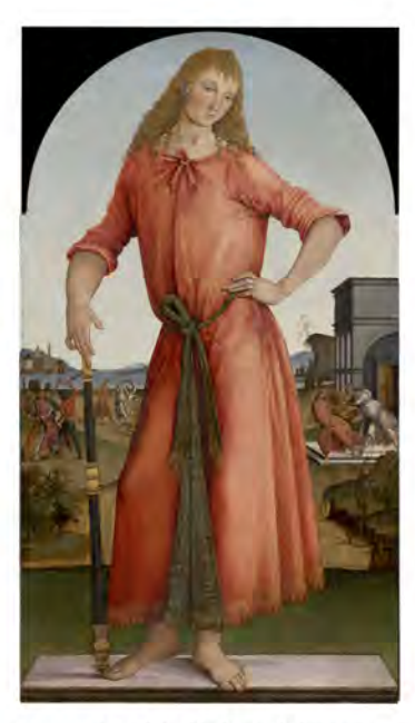
Master of the Griselda Legend, Eunostos of Tanagra, c. 1495/1500, tempera on panel transferred to canvas, Samuel H. Kress Collection

See Ovid Fasti 4.305–316 and Pliny Natural History 7.120.