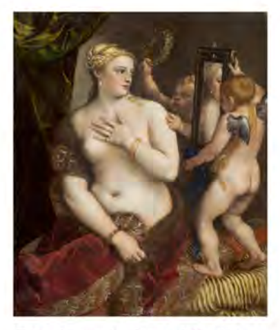
Titian, Venus with a Mirror, c. 1555, oil on canvas, Andrew W. Mellon Collection

See Odyssey 8.265–365. For English examples of epithalamia, see those of Sir Philip Sidney and Edmund Spenser.