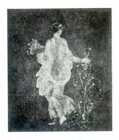
Roman, Spring, c. 1st century, perhaps based on Hellenistic model, from a wall painting at Stabiae, Museo Archeologico Nazionale, Naples

See Hesiod Works and Days, lines 60-89 and Theogony, lines 570-606.