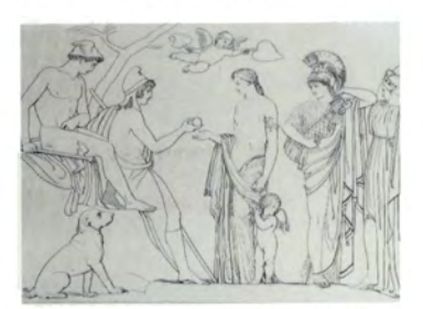
Hermes, Aphrodite, Athena, and Hera (pl. 37)