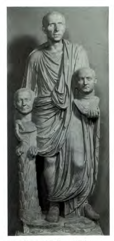
Roman, Roman Holding Busts of His Ancestors, c. 1st century, marble, Museo Capitolino, Rome

Through contact with Etruscans and with Greek cities in Italy, Rome had become familiar with the gods of Greece by the early republic. In 431 B.C., a temple to Apollo was