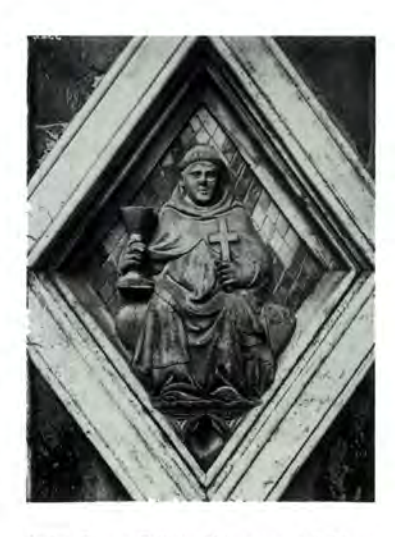
Andrea Pisano, Religion, 14th century, relief from the campanile of Santa Maria del Fiore, Museo dell'Opera del Duomo, Florence

The bell tower of Florence's cathedral included a series of reliefs depicting the planetary gods. Here Jupiter appears dressed in the robes of a monk and holding a chalice and cross. The representation may stem from Arabic descriptions of Jupiter/Marduk. Since Jupiter was the planet that held sway over Western (that is, Christian) lands, Arabic astronomical works specifically presented him in Christian guise.