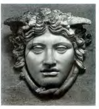
Greek, Gorgon, terra-cotta metope, 7th century, Museo Archeologico Regionale, Syracuse

The Rondanini Medusa, Roman copy of a 5th-century Greek original, marble, Staatliche Antikensammlungen und Glyptothek München