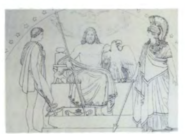
Hermes, Zeus, and Athena (pl. 1)