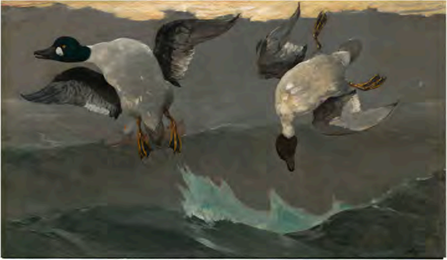
Winslow Homer, Right and Left , 1909. National Gallery of Art, Gift of the Avalon Foundation, 1951.8.1 The title refers to “right and left,” the sportsman’s feat of bringing down a bird with each muzzle of a double-barreled shotgun.