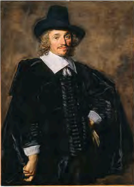
Frans Hals, Portrait of a Gentleman , c. 1650/1652. National Gallery of Art, Widener Collection, 1942.9.29