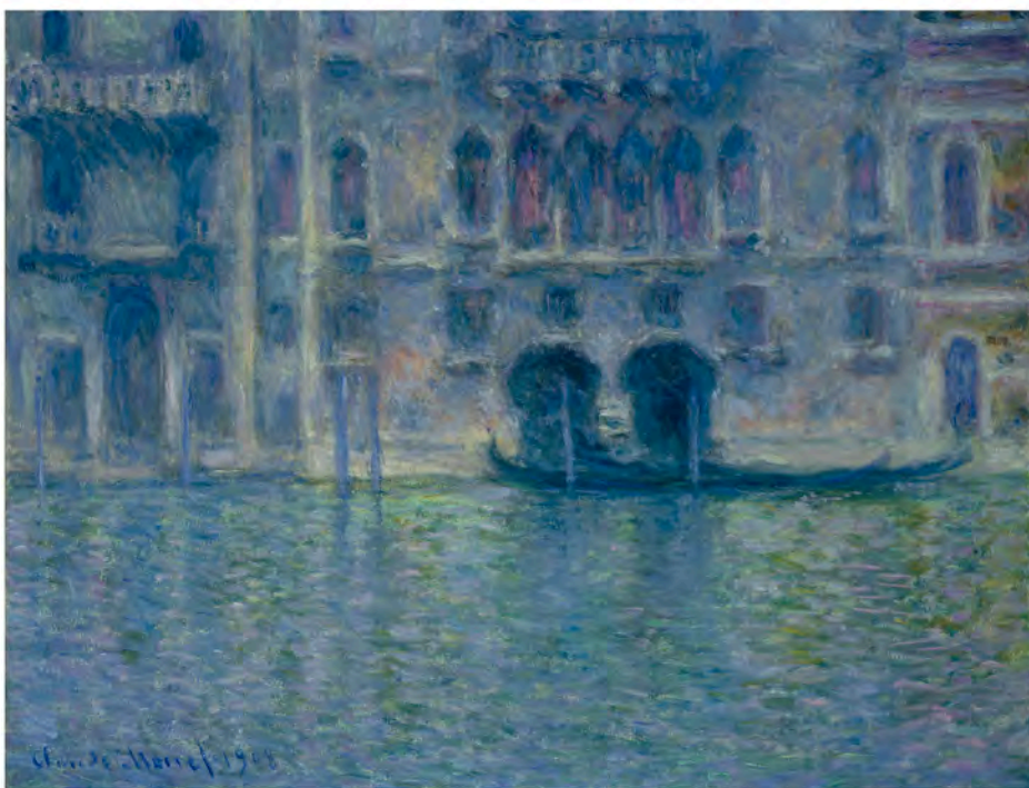
Claude Monet, Palazzo da Mula, Venice , 1908. National Gallery of Art, Chester Dale Collection, 1963.10.182