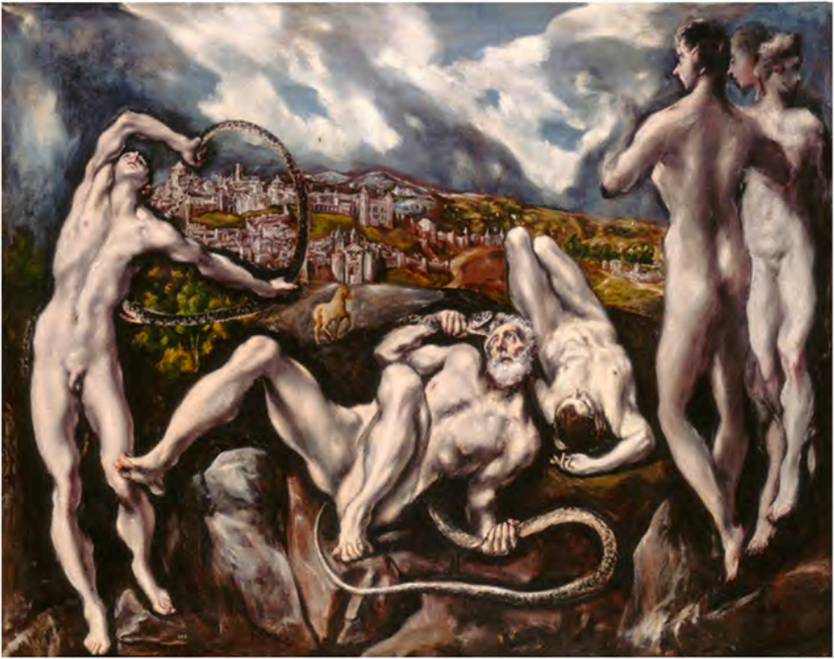
El Greco, Laocoön , c. 1610/1614. National Gallery of Art, Samuel H. Kress Collection, 1946.18.1