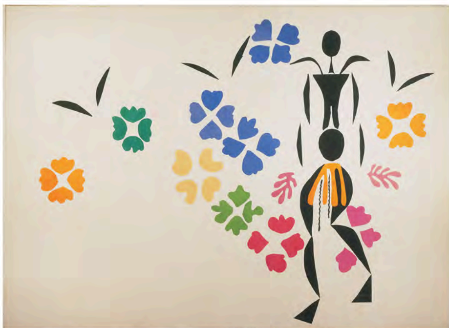
Henri Matisse, La Nègresse , 1952. National Gallery of Art, Ailsa Mellon Bruce Fund, 1973.6.1

Such seemingly abstract elements combine in La Nègresse to create a larger-than-life image of Josephine Baker, the famous American performer who first gained recognition in Paris in the 1920s. The orange cut-out covering the lower torso refers to an early costume that brought the dancer instant notoriety: a bunch of bananas. Forms that serve as limbs for the figure metamorphose into leaves or wings when placed among the clustered shapes that read as flowers. Near those arc-like forms there is still evidence of lines the eighty-two-year-old artist made with charcoal on the end of a long stick to indicate the placement of the cut-outs. Pinholes made by his assistants as they arranged and rearranged the parts for his approval are visible as well.