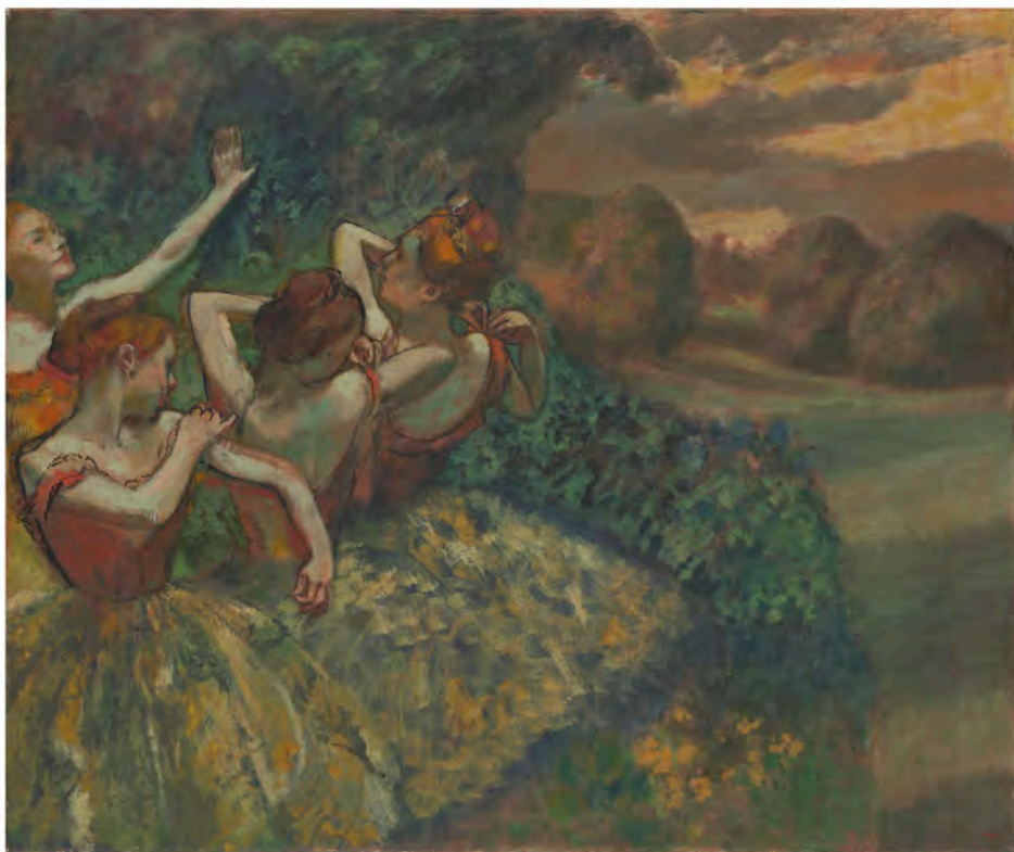
Edgar Degas, Four Dancers , c. 1899. National Gallery of Art, Chester Dale Collection, 1963.10.122

their shoulder straps, preparing to twirl their way onto the stage. Degas was aware of and may have owned sequential photographs of humans and animals in motion; this late work depicting a row of ballerinas was perhaps inspired by such images. Each dancer turns in what appears to be a further progression of the same action, leaving the viewer to wonder if the image represents a group of dancers or a single figure.