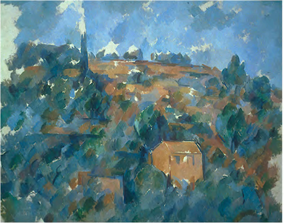
Paul Cézanne, House on a Hill , 1904/1906. The White House Collection, USG-6

intended to repaint. Elements of Degas' late style that signify a marked change in his approach parallel those of other artists: larger figures, vigorously modeled with broader, bolder brushwork and brought closer to the picture plane.