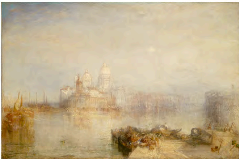
Joseph Mallord William Turner, The Dogana and Santa Maria della Salute, Venice , probably 1843. National Gallery of Art, Given in memory of Governor Alvan T. Fuller by the Fuller Foundation, 1961.2.3