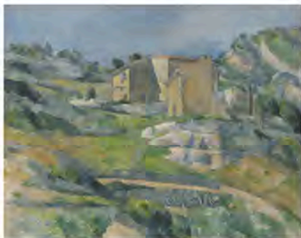
Paul Cézanne, Houses in Provence , c. 1880. National Gallery of Art, Collection of Mr. and Mrs. Paul Mellon, 1973.68.1

Cézanne was well aware of the revolutionary nature of his art. He was convinced of its greatness but, at the same time, was dissatisfied with it. "I am the primitive of the way I have discovered," he said (John Canaday, Mainstreams of Modern Art [New