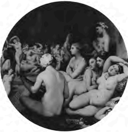
Jean-Auguste-Dominique Ingres, The Turkish Bath , c. 1851–1863. Musée du Louvre, Paris

The aged Ingres returned in some of his late works to the theme of the female nude, reviving and recombining images from his earlier years and treating them in a more corporeal and erotic manner. In his eighty-second year he proudly inscribed his age on a painting of a Turkish bath crowded with some twenty-five sensual, languid nudes in anything but classical poses. In that same year, the master was also appointed to the French Senate.