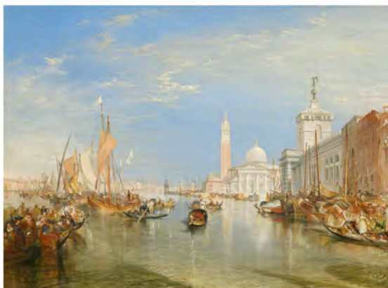
Joseph Mallord William Turner, Venice: Dogana and San Giorgio Maggiore , probably 1834. National Gallery of Art, Widener Collection, 1942.9.85

The subjects and compositions of Turner's later works for the most part remain similar to those of earlier years, continuing to represent his