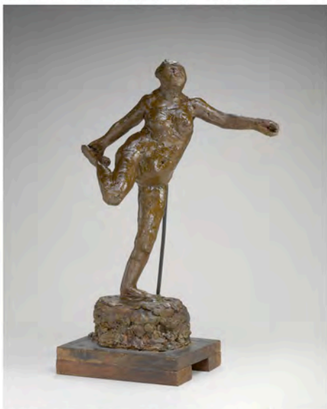
Edgar Degas, Dancer Holding Her Right Foot in Her Right Hand , probably 1900/1910. National Gallery of Art, Collection of Mr. and Mrs. Paul Mellon, 1985.64.56

layer of paint only partially covering rather than totally obscuring preceding layers of color. Black outlines around the bodices and arms of the dancers indicate passages the artist