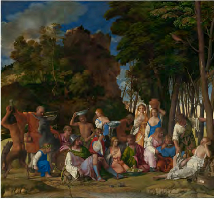
Giovanni Bellini and Titian, The Feast of the Gods , 1514/1529. National Gallery of Art, Widener Collection, 1942.9.1