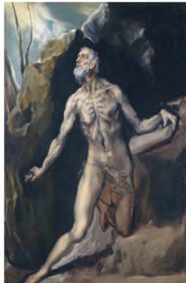
El Greco, Saint Jerome , c. 1610/1614. National Gallery of Art, Washington, Chester Dale Collection, 1943.7.6

city in the background is intended to represent Troy, but the stone entrance and the castle beyond are recognizable as Toledo’s southern gate and its