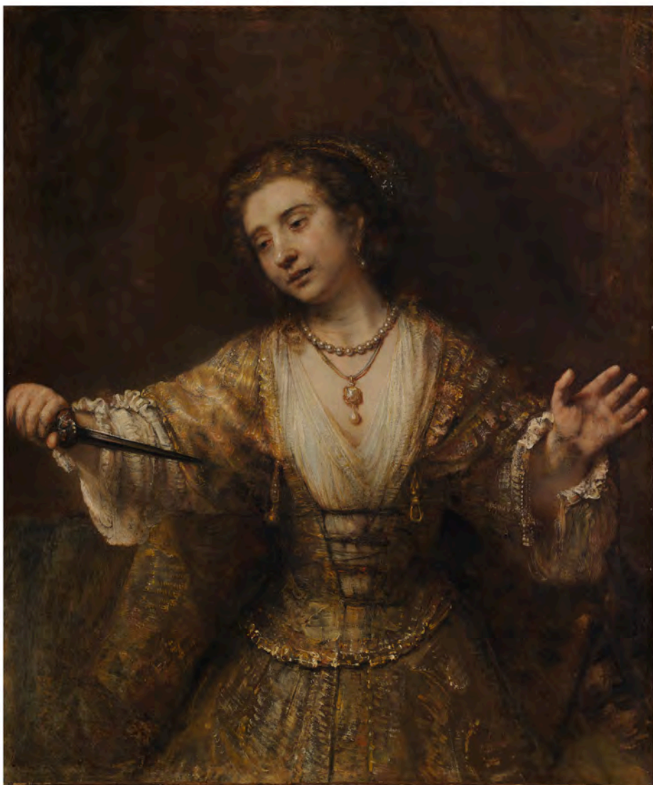
Rembrandt van Rijn, Lucretia , 1664. National Gallery of Art, Andrew W. Mellon Collection, 1937.1.76