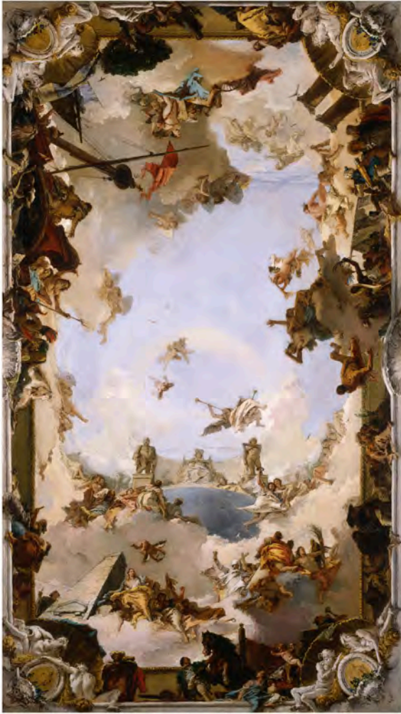
Giovanni Battista Tiepolo, The World Pays Homage to Spain , probably 1762. National Gallery of Art, Samuel H. Kress Collection, 1943.4.39