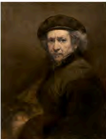
Rembrandt van Rijn, Self-Portrait , 1659. National Gallery of Art, Andrew W. Mellon Collection, 1937.1.72

translating his inner moods into paint. While most artists eventually portray themselves, Rembrandt produced an unprecedented number of self-portraits: sixty in oils alone and nearly a hundred including drawings and engravings. They became a means of exploring the intangibles of mood and personality and giving them visible form. In Self-Portrait , 1659, he no longer resorts to disguises and contrived expressions; little attention is given to his garb and less to his surroundings. Instead this penetrating analysis, painted at the beginning of his last decade, focuses entirely on its subject; it seems to sum up the artist's experience, suggesting quiet resignation, perhaps, but not defeat. Like Lucretia this image seems to transcend the limitations of a picture and take on the aura of a presence.