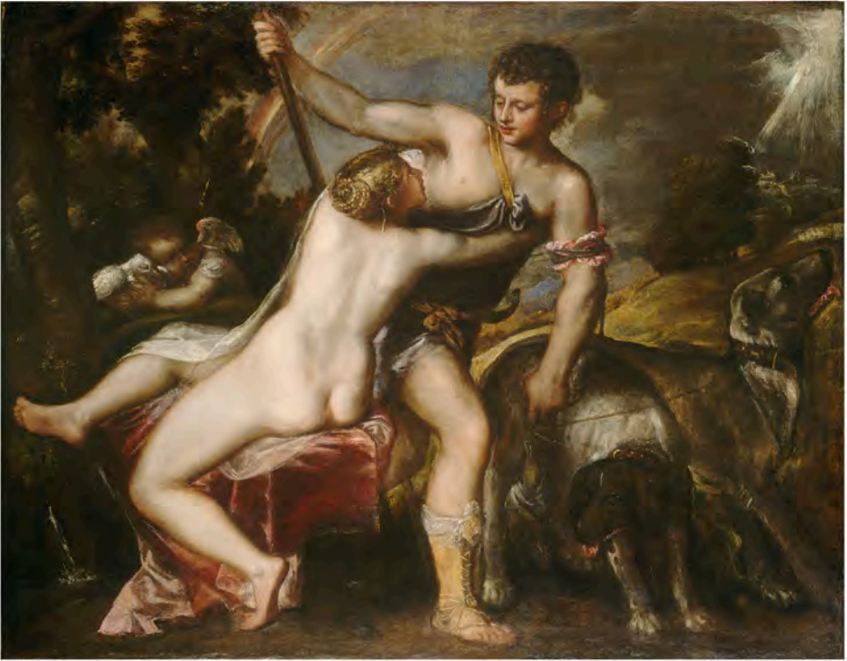
Titian, Venus and Adonis , c. 1560. National Gallery of Art, Widener Collection, 1942.9.84