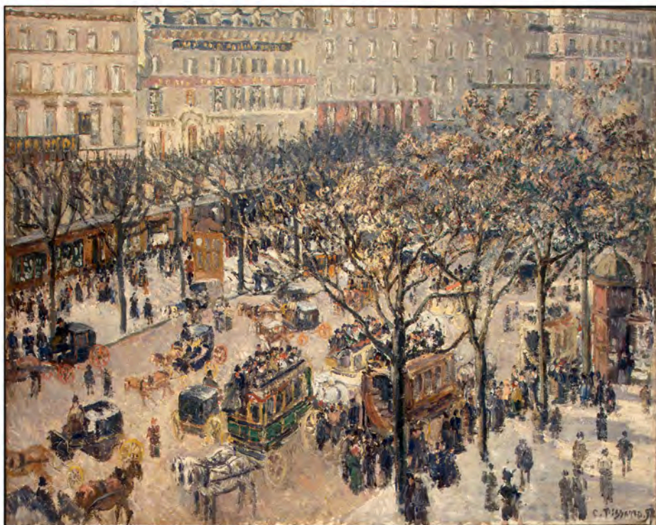
Camille Pissarro, Boulevard des Italiens, Morning, Sunlight , 1897. National Gallery of Art, Chester Dale Collection, 1963.10.198