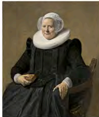
Frans Hals, Portrait of an Elderly Lady , 1633. National Gallery of Art, Washington, Andrew W. Mellon Collection, 1937.1.67

Hals painted his last pair of group portraits as an octogenarian in 1664; it is all the more remarkable that these paintings were life-size and comprised individual characterizations of eleven figures. While the originality and spontaneity of his manner in portraiture were appreciated during his lifetime, after his death Hals' reputation was eclipsed by a shift in taste that rejected his works as lacking in finish, the very quality that would become the basis for celebrating the modern relevance of the artist's works two hundred years later.