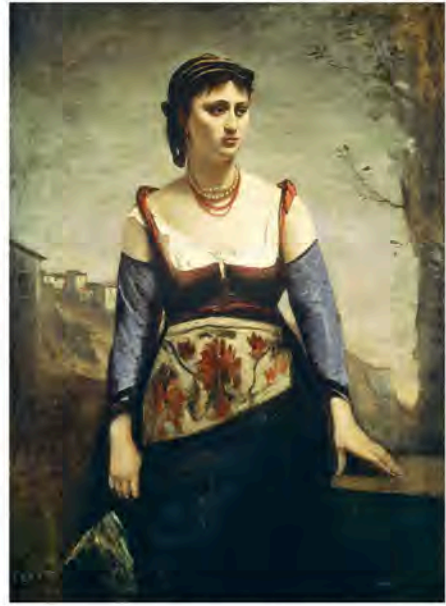
Jean-Baptiste-Camille Corot, Agostina , probably 1866. National Gallery of Art, Chester Dale Collection, 1963.10.108