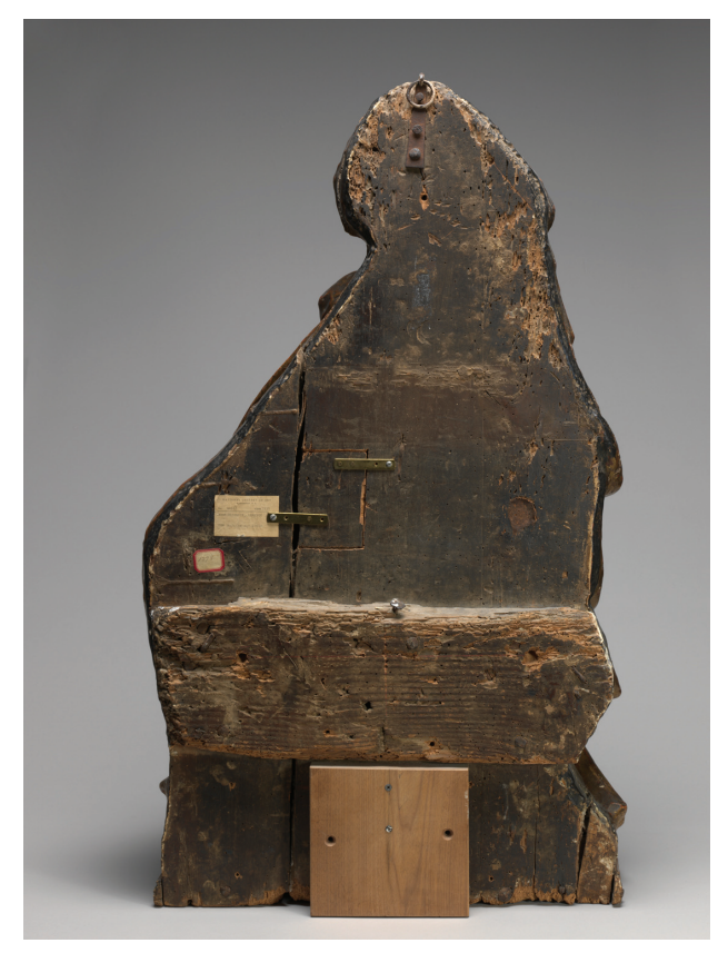
Figure 2 Madonna and Child, reverse.

The reverse is formed primarily by a single wooden panel shaped to the terracotta (Fig. 2) and attached to it, after firing, by means of long iron nails. No other terracotta sculpture with a wooden backing has been identified,