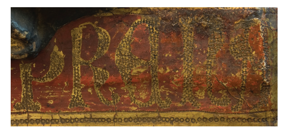
Figure 6 Detail of the inscription.

on the Kress Madonna was identified as calcium sulfate anhydrite (Douglas 2007) and dihydrate (Palmer 2009) in a protein binder. On the side edges of the crossbar, and on the underside, bright red and blue wool fibers are visible mixed into the ground, presumably as a bulking agent, and they recall the mixture of plaster and wool fibers found in Pietro Torrigiano's portrait bust of King Henry VII, dating from around 1509–1511 (Galvin and Lindley 1988, p. 897).