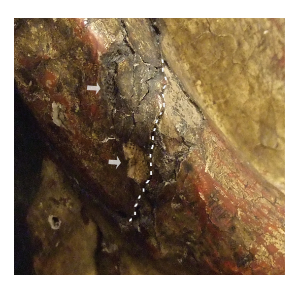
Figure 5 Detail showing continuation of terracotta fold, in cloth, onto edge of wooden backing. Arrows point to exposed textile; the dotted line indicates the terracotta/wood boundary.

Linen, identified using transmitted light microscopy, is present along the length of the join between the terracotta and the wood, as well as over the seams between the edging and the base. Its presence here recalls the technique used for the construction of large panel paintings, and of the background panel in Donatello's plaster relief Madonna dei Cordai . In that work, the seams between the four poplar boards are overlaid with strips of linen (Kumar