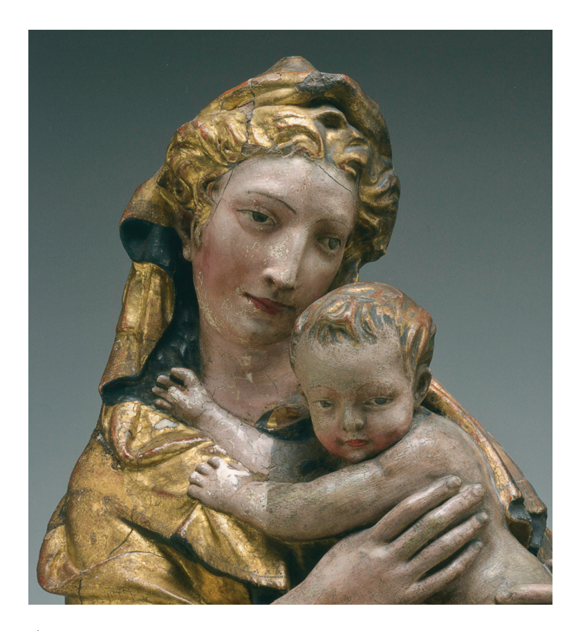
Figure 3 Detail, during removal of surface dirt.