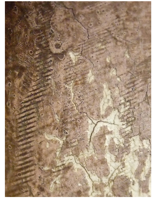
Figure 4 During treatment, detail of Child's left leg, showing parallel shading marks.

terracotta is exposed will not be filled, since they do not detract from one's appreciation of the work.