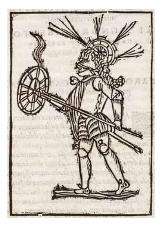
Artist unknown, detail from Giovanni Battista Isacchi, Inventioni , Parma: Seth Viotto, 1579, David K. E. Bruce Fund

These technical manuals and festival books drawn from the Special Collections of the National Gallery of Art Library present an array of techniques and strategies. Representing many different times and places, they show how the technology and artistry of fireworks displays and the methods for recording them evolved in seventeenth- and eighteenth-century Europe, as rulers projected their power and prestige through pyrotechnic delights.