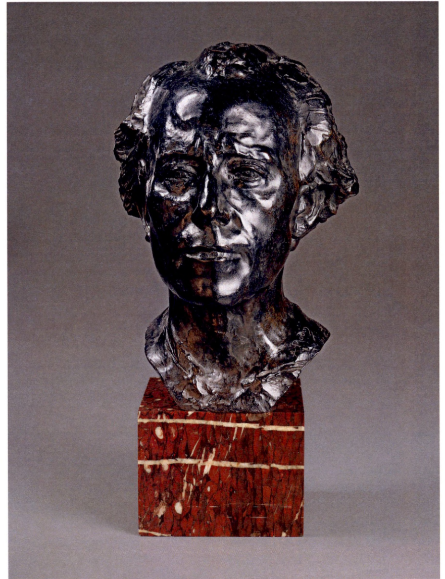
BRONZE BUST OF WASHINGTON