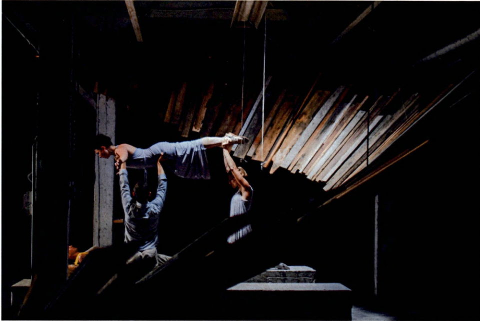
Euridice's death.