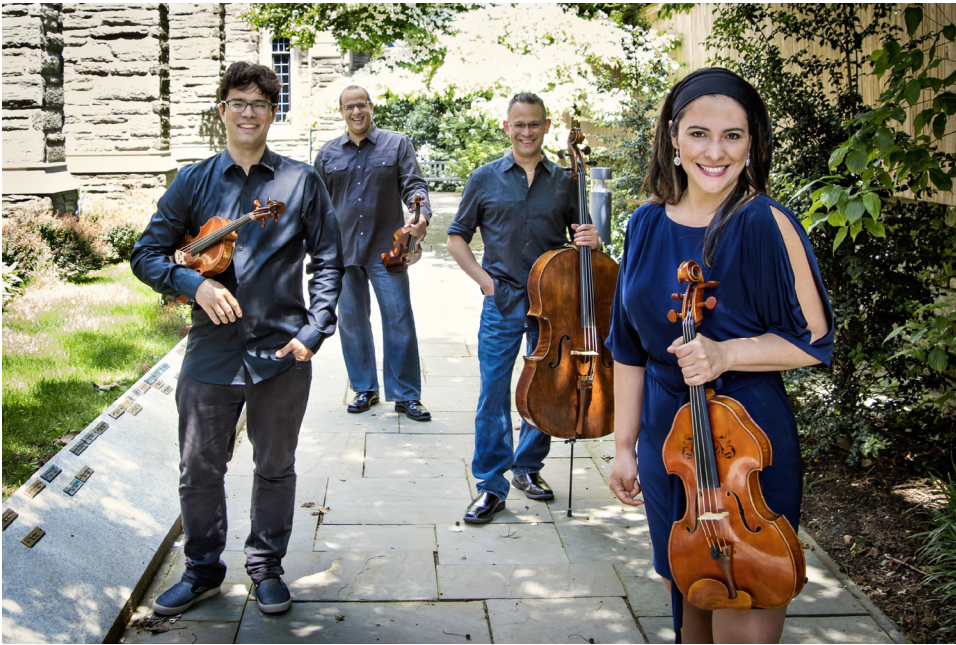
Dalí Quartet