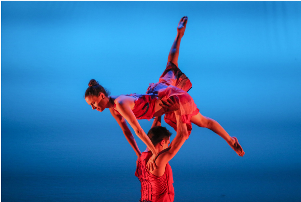
Artichoke Dance Company