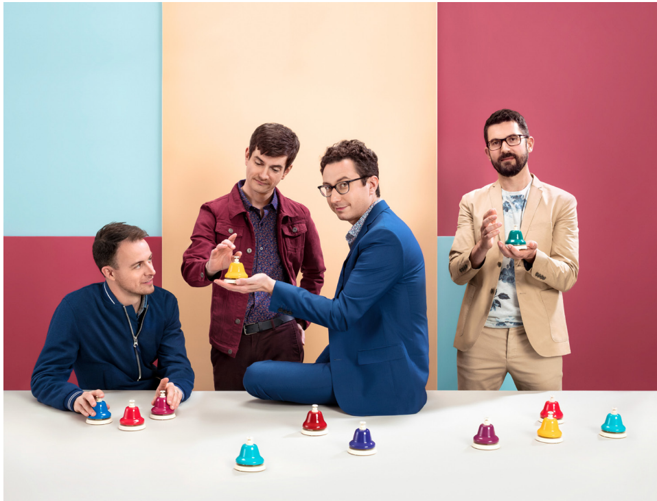
Third Coast Percussion