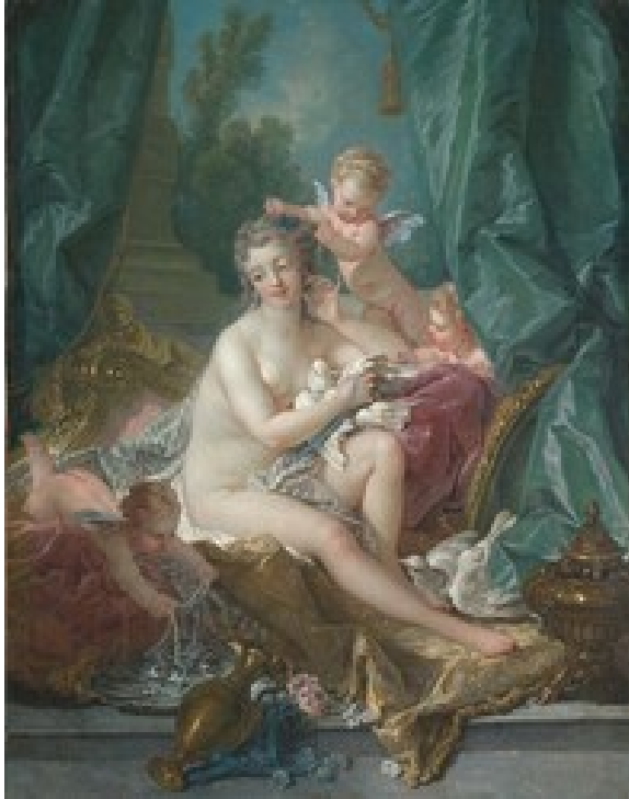
fig. 1 François Boucher, The Toilet of Venus , 1751, oil on canvas, The Metropolitan Museum of Art, Bequest of William K. Vanderbilt, 1920 (20.155.9). www.metmuseum.org