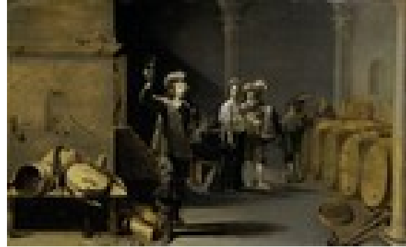
fig. 12 Jacob Duck, The Wine Connoisseurs , c. 1640–1642, oil on panel, Rijksmuseum, Amsterdam, Purchased with the support of the Vereniging Rembrandt, SK-A-1940