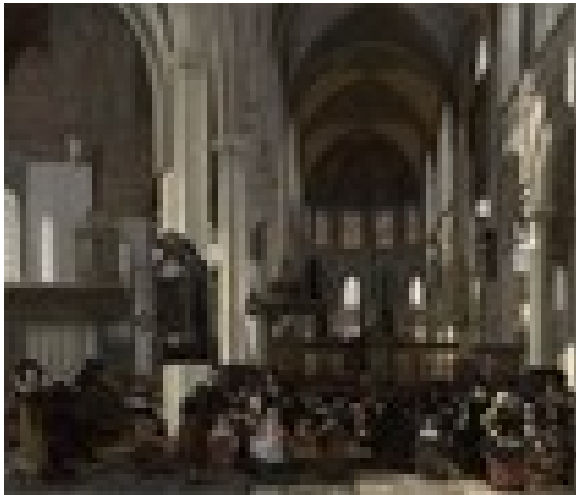
fig. 3 Emanuel de Witte, Interior of the Oude Kerk, Amsterdam, with Townsfolk Gathered for a Service , c. 1660–1665, oil on canvas, Eijk and Rose-Marie van Otterloo Collection