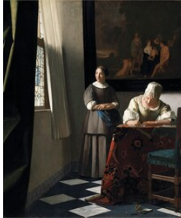
fig. 6 Johannes Vermeer, Woman Writing a Letter, with Her Maid , c. 1670–1671, oil on canvas, National Gallery of Ireland, Dublin, Sir Alfred and Lady Beit, 1987 (Beit Collection), NGI.4535.