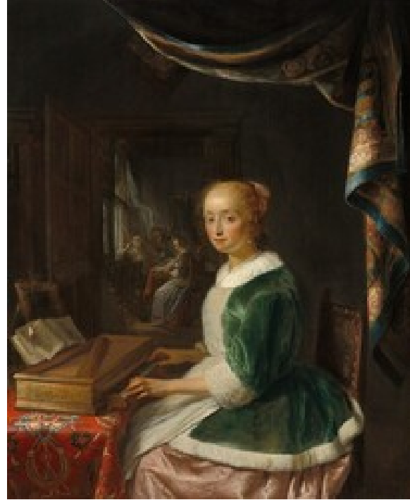
fig. 10 Gerrit Dou, A Young Lady Playing a Clavichord , c. 1667, oil on panel, Private collection