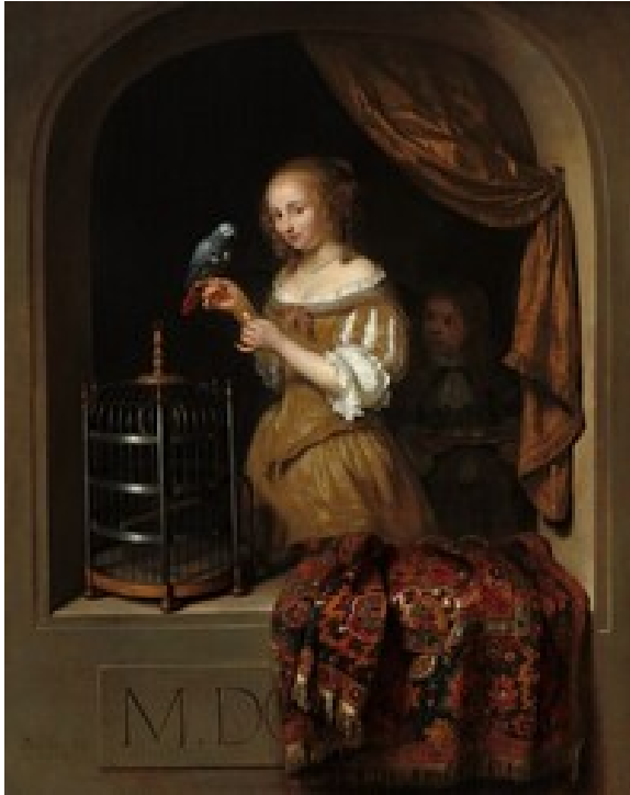
fig. 5 Caspar Netscher, A Woman Feeding a Parrot, with a Page , 1666, oil on panel, National Gallery of Art, Washington, The Lee and Juliet Folger Fund, 2016.118.1