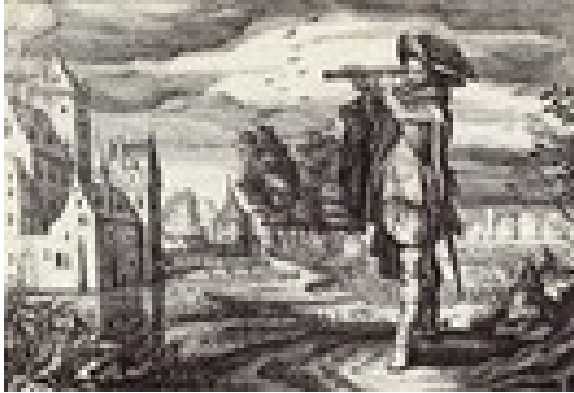
fig. 11 Adriaen van de Venne, Early depiction of a Dutch telescope , 1624, print, Johan de Brune de Oude. Emblemata of Zinne-werck , Amsterdam, 1624, nr. 47. Digitale Bibliotheek voor de Nederlandse Letteren NOTES