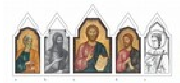
fig. 2 Reconstruction of a dispersed polyptych by Grifo di Tancredi (color images are NGA objects): a. Saint Peter ; b. Saint John the Baptist (fig. 2); c. Christ Blessing ; d. Saint James Major ; e. After Grifo di Tancredi, line drawing of a lost image of Saint Ursula