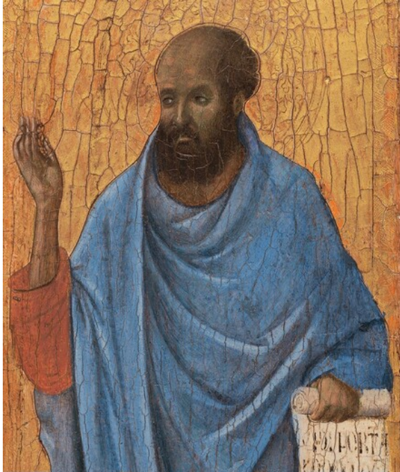
fig. 1 Detail of Ezekiel, Duccio di Buoninsegna, The Nativity with the Prophets Isaiah and Ezekiel , 1308–1311, tempera on poplar, National Gallery of Art, Washington, Andrew W. Mellon Collection