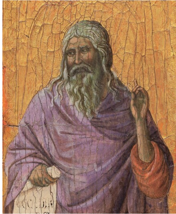
fig. 2 Detail of Isaiah, Duccio di Buoninsegna, The Nativity with the Prophets Isaiah and Ezekiel , 1308–1311, tempera on poplar, National Gallery of Art, Washington, Andrew W. Mellon Collection