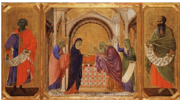
fig. 7 Duccio di Buoninsegna, The Presentation in the Temple with Salomon (or David?) and the Prophet Malachi , 1308–1311, tempera on panel, Museo dell'Opera del Duomo, Siena.