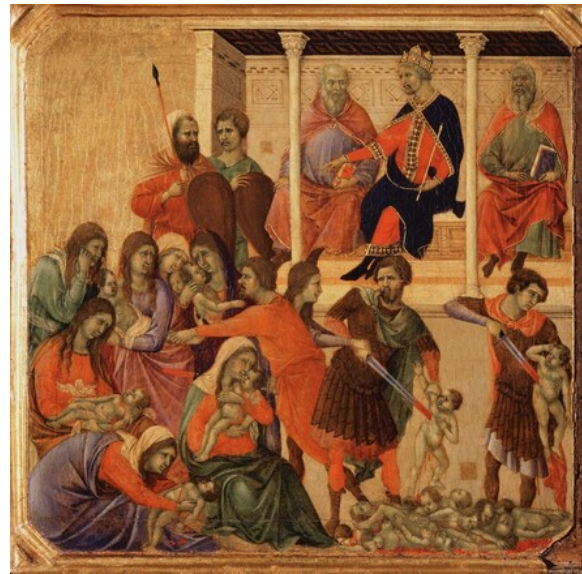
fig. 6 Duccio di Buoninsegna, The Massacre of the Innocents , 1308–1311, tempera on panel, Museo dell'Opera del Duomo, Siena.