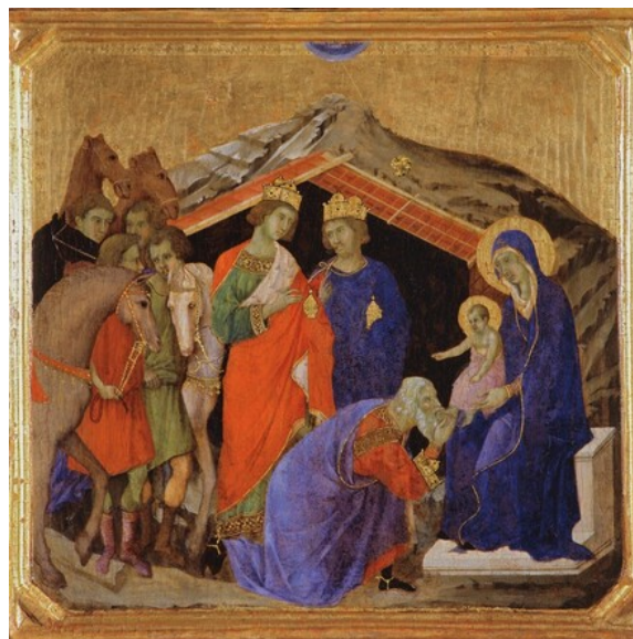
fig. 4 Duccio di Buoninsegna, The Adoration of the Magi , 1308–1311, tempera on panel, Museo dell'Opera del Duomo, Siena.