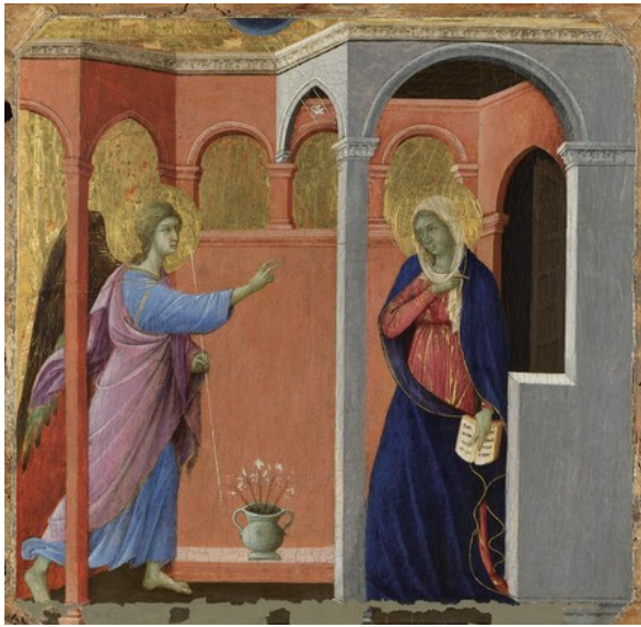
fig. 3 Duccio di Buoninsegna, The Annunciation , 1308–1311, tempera on panel, The National Gallery, London.