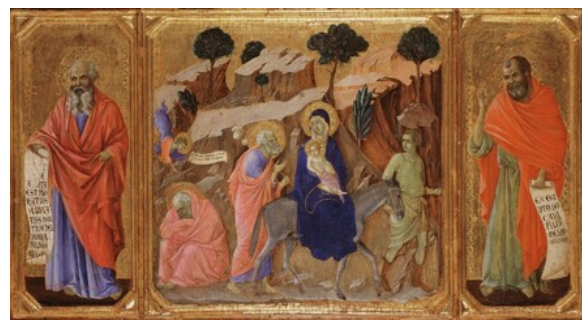
fig. 8 Duccio di Buoninsegna, The Flight into Egypt with the Prophets Jeremiah and Hosea , 1308–1311, tempera on panel, Museo dell'Opera del Duomo, Siena.