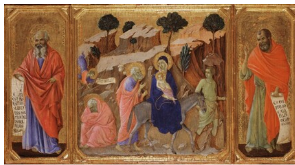
fig. 8 Duccio di Buoninsegna, The Flight into Egypt with the Prophets Jeremiah and Hosea , 1308–1311, tempera on panel, Museo dell'Opera del Duomo, Siena.