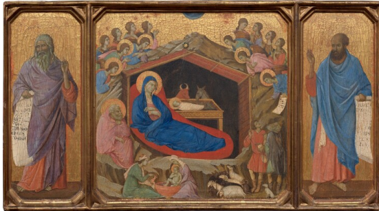
Duccio di Buoninsegna Siense, c. 1250/1255 - 1318/1319