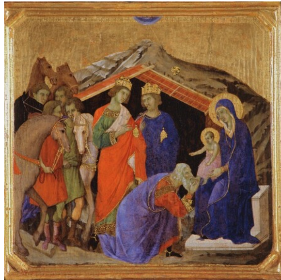
fig. 4 Duccio di Buoninsegna, The Adoration of the Magi , 1308–1311, tempera on panel, Museo dell'Opera del Duomo, Siena.