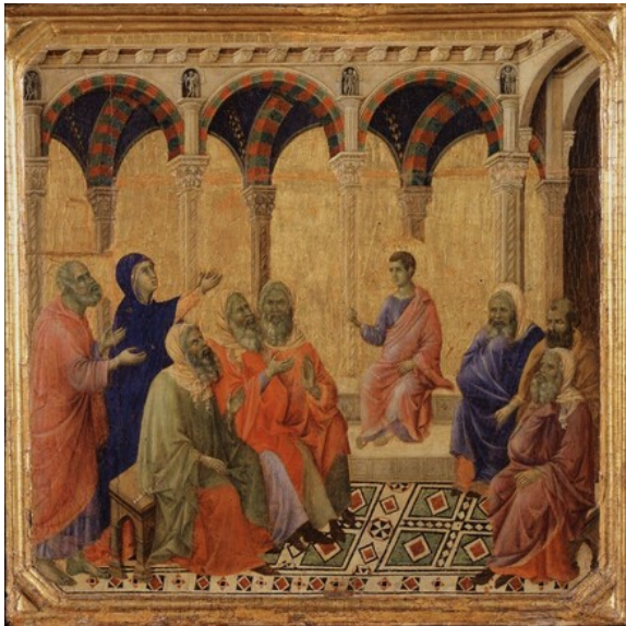
fig. 5 Duccio di Buoninsegna, Christ among the Doctors , 1308–1311, tempera on panel, Museo dell'Opera del Duomo, Siena.