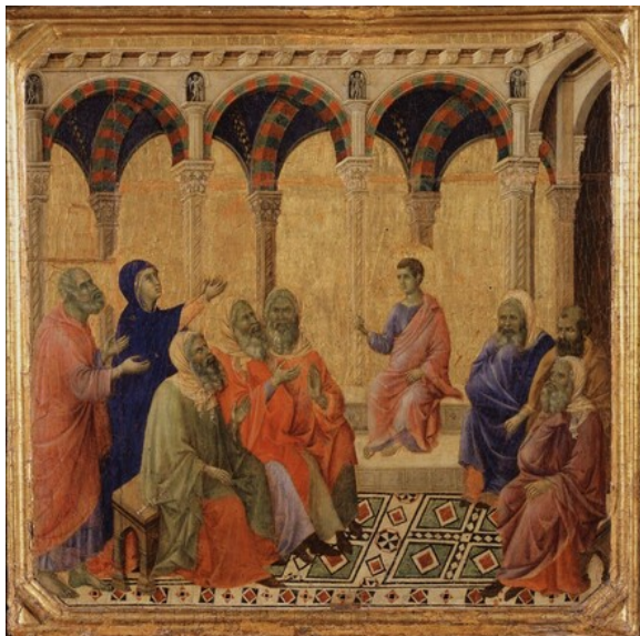
fig. 5 Duccio di Buoninsegna, Christ among the Doctors , 1308–1311, tempera on panel, Museo dell'Opera del Duomo, Siena.