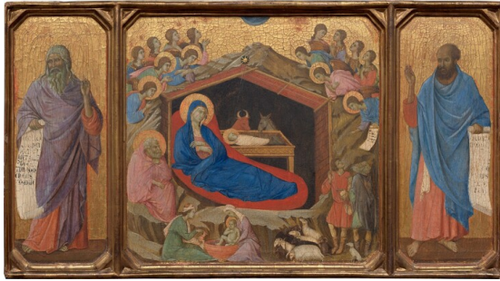
Duccio di Buoninsegna Sienese, c. 1250/1255 - 1318/1319