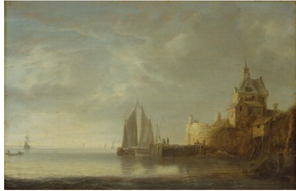
fig. 2 Simon de Vlieger, View of the Oostpoort , c. 1640, Hamburg Kunsthalle