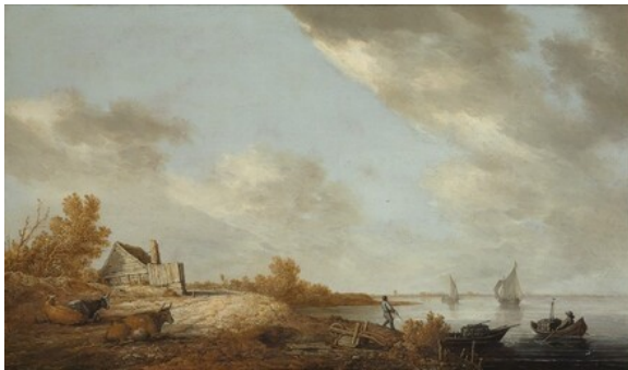
fig. 3 Aelbert Cuyp, Cattle and Cottage Near a River , early 1640s, Museum Boijmans Van Beuningen, Rotterdam.