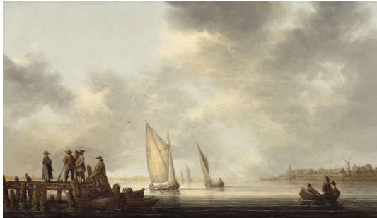
Aelbert Cuyp Dutch, 1620 - 1691