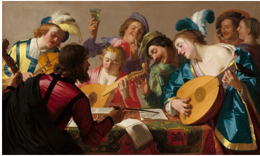
Gerrit van Honthorst Dutch, 1592 - 1656