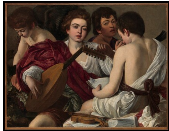
fig. 2 Michelangelo Merisi da Caravaggio, The Musicians , c. 1595, oil on canvas, Metropolitan Museum of Art, New York, Rogers Fund, 1952 (52.81)