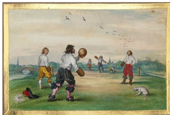
fig. 8 Detail, Adriaen van de Venne, "A Game of Balloon," from Adriaen van de Venne's Common-Place Book , c. 1626, watercolor, The British Museum, London.