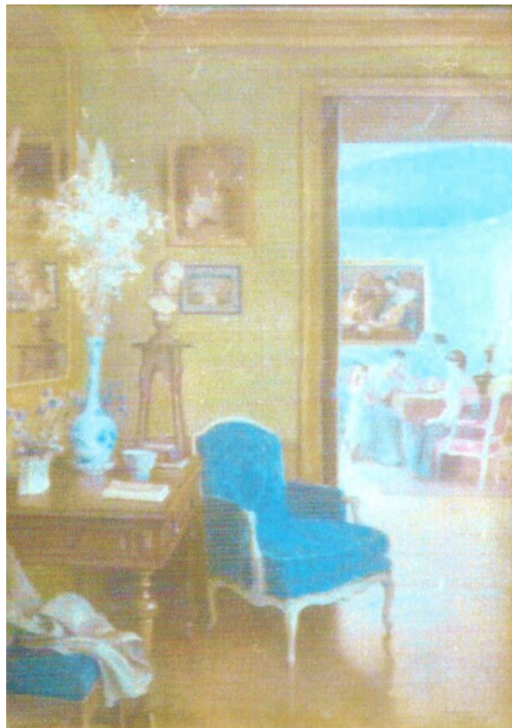
fig. 6 Etienne Azambre, Interior of a French Country Estate , c. 1900, watercolor, private collection