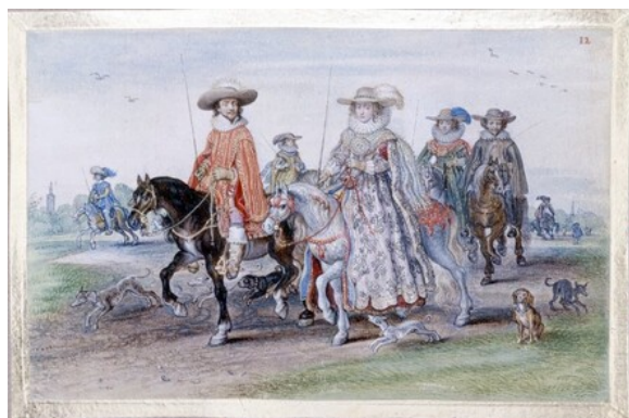
fig. 7 Adriaen van de Venne, "The King and Queen of Bohemia," from Adriaen van de Venne's Common-Place Book , c. 1626, watercolor, The British Museum, London.