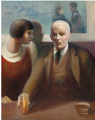
Guy Pène du Bois American, 1884 - 1958