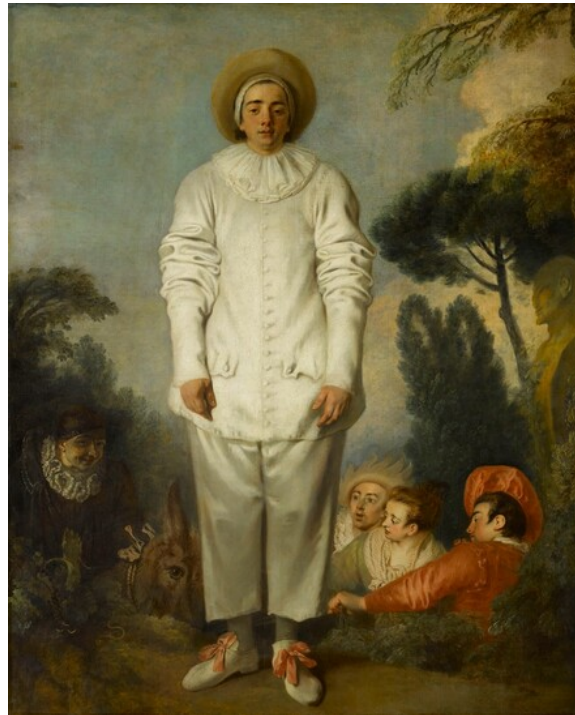
fig. 2 Jean-Antoine Watteau, Pierrot, formerly known as Gilles , c. 1718–1719, oil on canvas, Musée du Louvre, Paris.