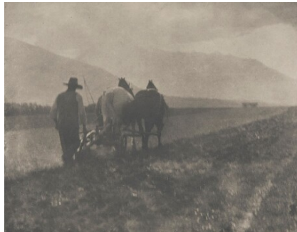
Alfred Stieglitz (editor/publisher) after Various Artists Alfred Stieglitz Ploughing 1904, printed 1905 photogravure Key Set Number 295