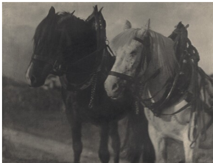
Alfred Stieglitz Horses—Tiro! 1904, printed before 1909 photogravure Key Set Number 297 same negative