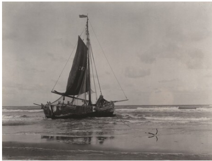
Alfred Stieglitz At Anchor 1894, printed 1929/1934 gelatin silver print Key Set Number 232 same negative