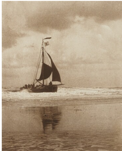
Alfred Stieglitz The Incoming Boat 1894, probably printed 1897 photogravure Key Set Number 229