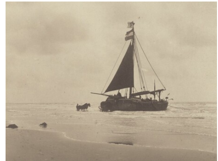
Alfred Stieglitz Unloading 1894, printed 1895/1896 platinum print Key Set Number 230