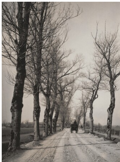
Alfred Stieglitz November Days 1887, printed 1929/1934 gelatin silver print Key Set Number 55 same negative