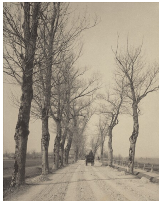
Alfred Stieglitz American, 1864 - 1946