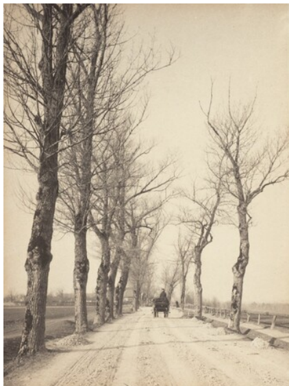
Alfred Stieglitz November Days 1887, printed 1895/1896 platinum print Key Set Number 54 same negative