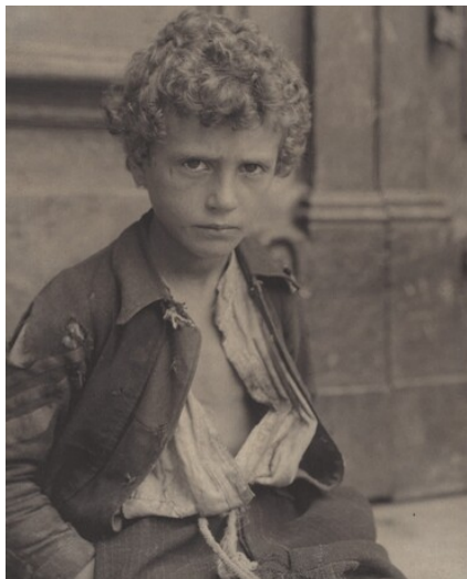
Alfred Stieglitz A Venetian Gamin 1894 platinum print Key Set Number 167 same negative