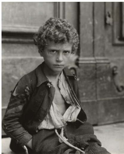
Alfred Stieglitz A Venetian Gamin 1894, printed 1929/1934 gelatin silver print Key Set Number 169 same negative