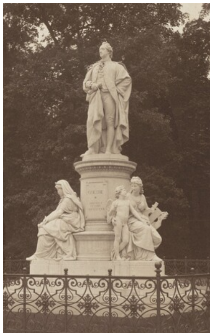
Alfred Stieglitz Goethe, Berlin probably 1886, printed 1895/1896 platinum print Key Set Number 31