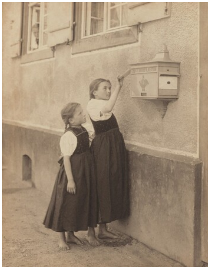
Alfred Stieglitz The Letterbox 1894, printed 1895/1896 platinum print Key Set Number 182 same negative