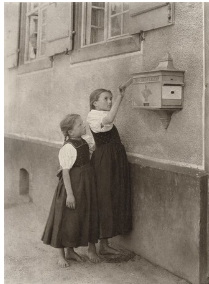
Alfred Stieglitz The Letterbox 1894, printed 1897 photogravure Key Set Number 183 same negative