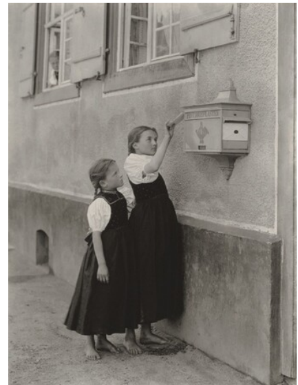
Alfred Stieglitz The Letterbox 1894, printed 1929/1934 gelatin silver print Key Set Number 184 same negative