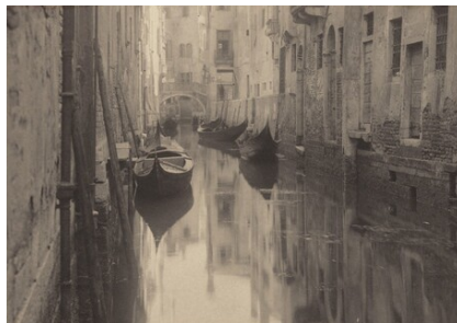
Alfred Stieglitz A Bit of Venice 1894, printed 1895/1896 platinum print Key Set Number 147 same negative