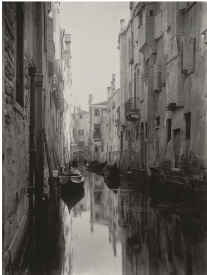
Alfred Stieglitz Venetian Canal 1894, printed 1929/1934 gelatin silver print Key Set Number 149 same negative