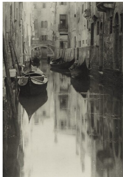
Alfred Stieglitz A Venetian Canal 1894, printed 1897 photogravure Key Set Number 148 same negative