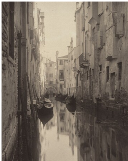
Alfred Stieglitz Venice 1894, printed 1895/1896 platinum print Key Set Number 146 same negative